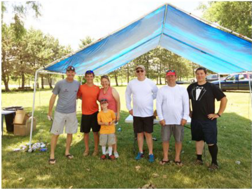
Champions: Team Dieball