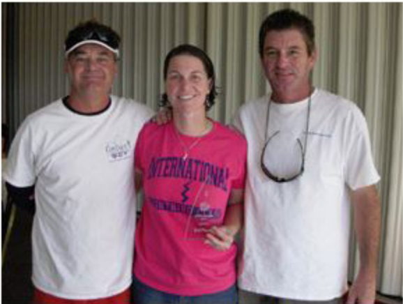
Team Jeffers - Third Place