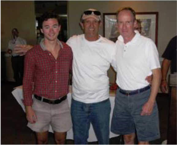
Team Mauk - First Place