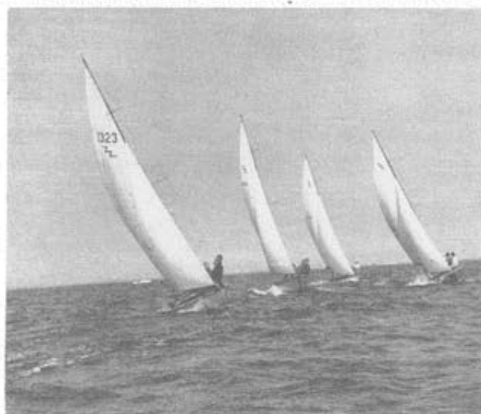
Sheepshead Fleet—"Aurora," "Walrita," "Leap'n'Lena," "Dinah."