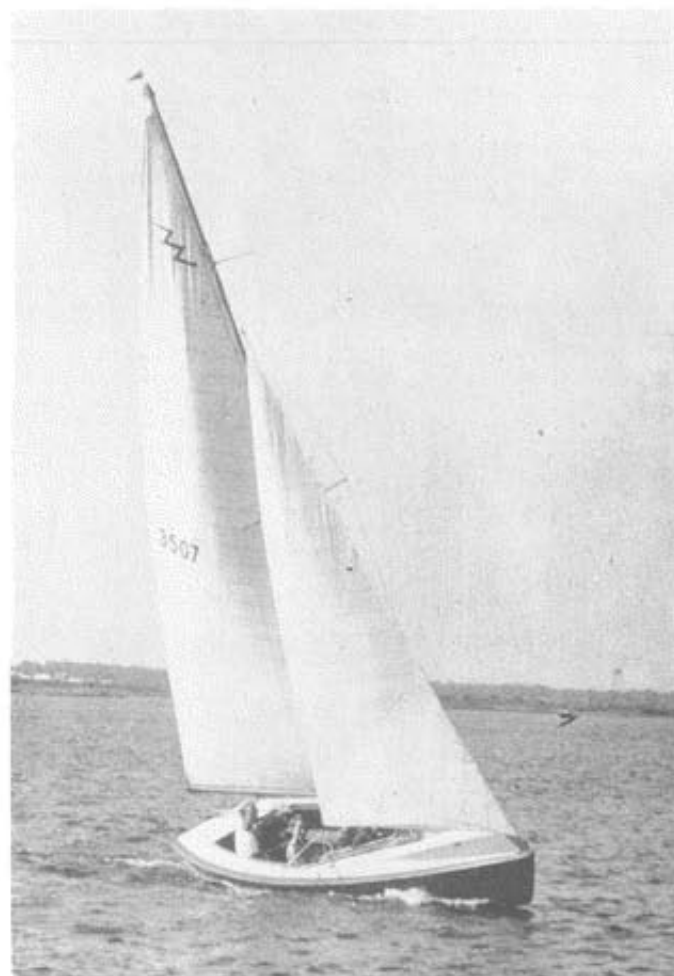
"Red Head" tuning up on Barnegat Bay.

The Fleet expects to be larger next year, and is looking forward to an interesting 1950 season.