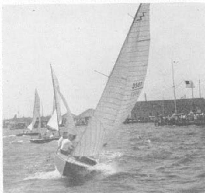
On Barnegat Bay.