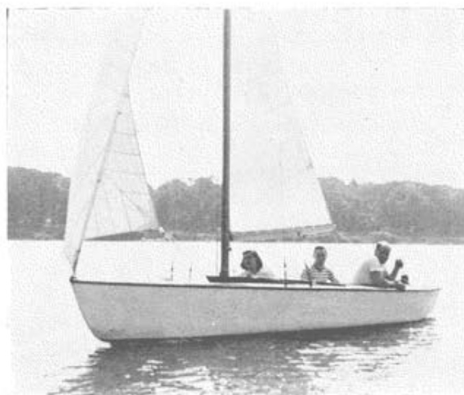
Cruising on Silver Lake.