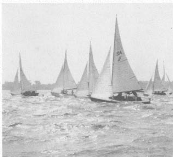
Niagara River Championship, 2nd race.