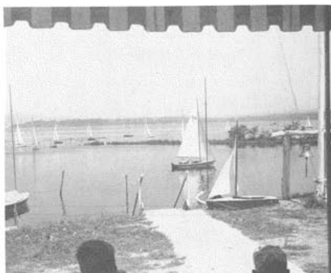
Looking out on the Hudson River from the Miniseco Yacht Club, home of the High-Tor Fleet.