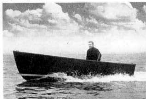
SEAMAN 16' LAUNCH