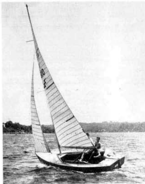
THE SEAMAN LIGHTNING—NONE FINER