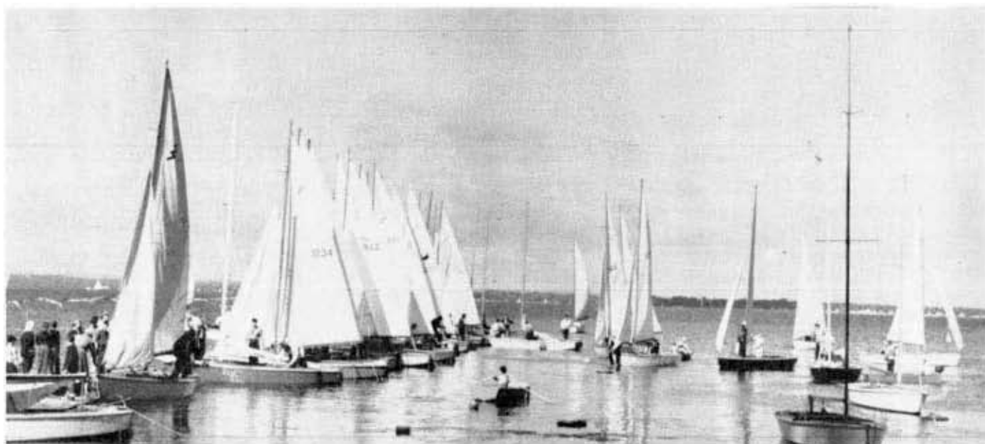
Part of the Fleet of forty boats which participated in Fleet 93 Invitational Regatta.

The following week the fleet championship series started and