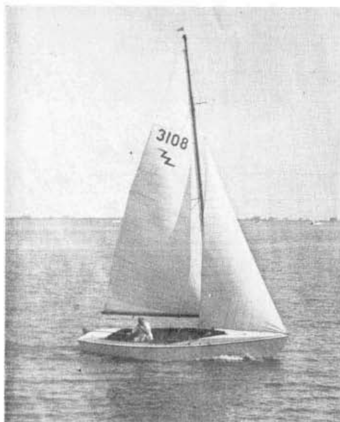
"So Long"—No. 3108 skippered by Fleet 80 Champion, Leighton Waters.