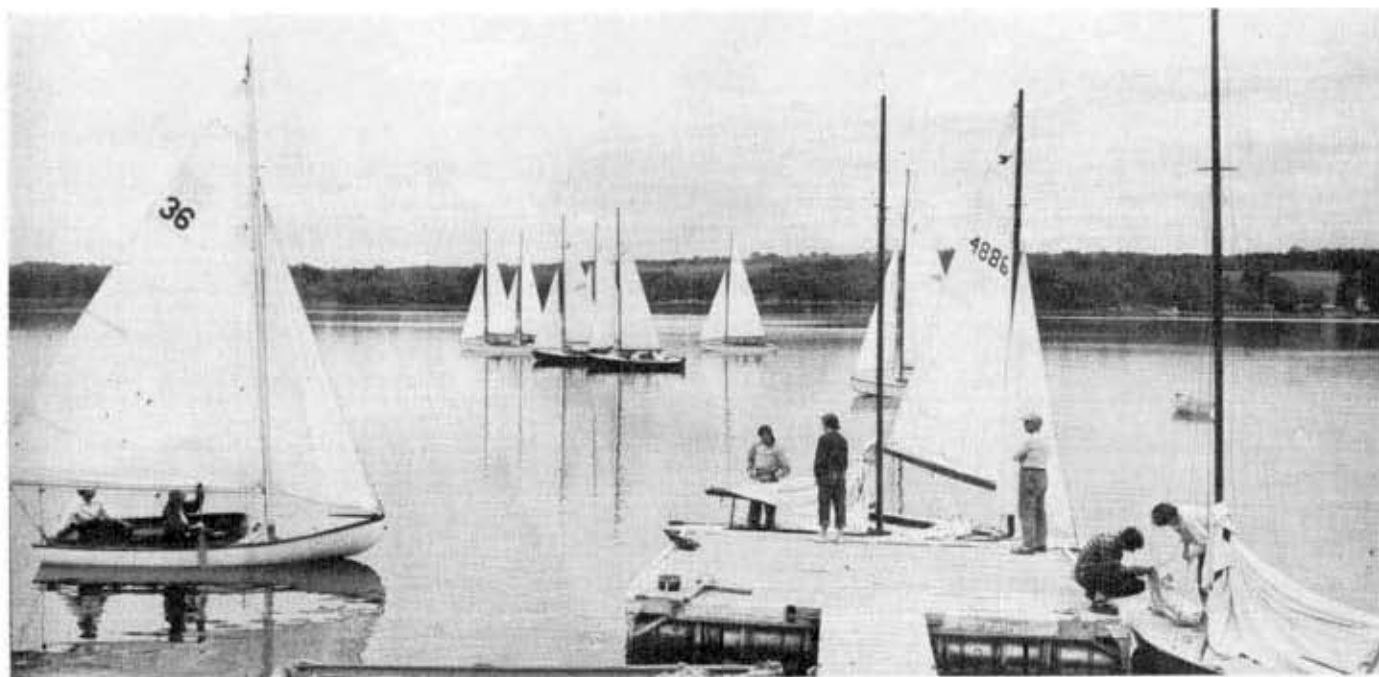
Fleet 101's entire Fleet at the start of a race.

Labor Day was the final day of racing and a most successful season ended with our annual clambake.