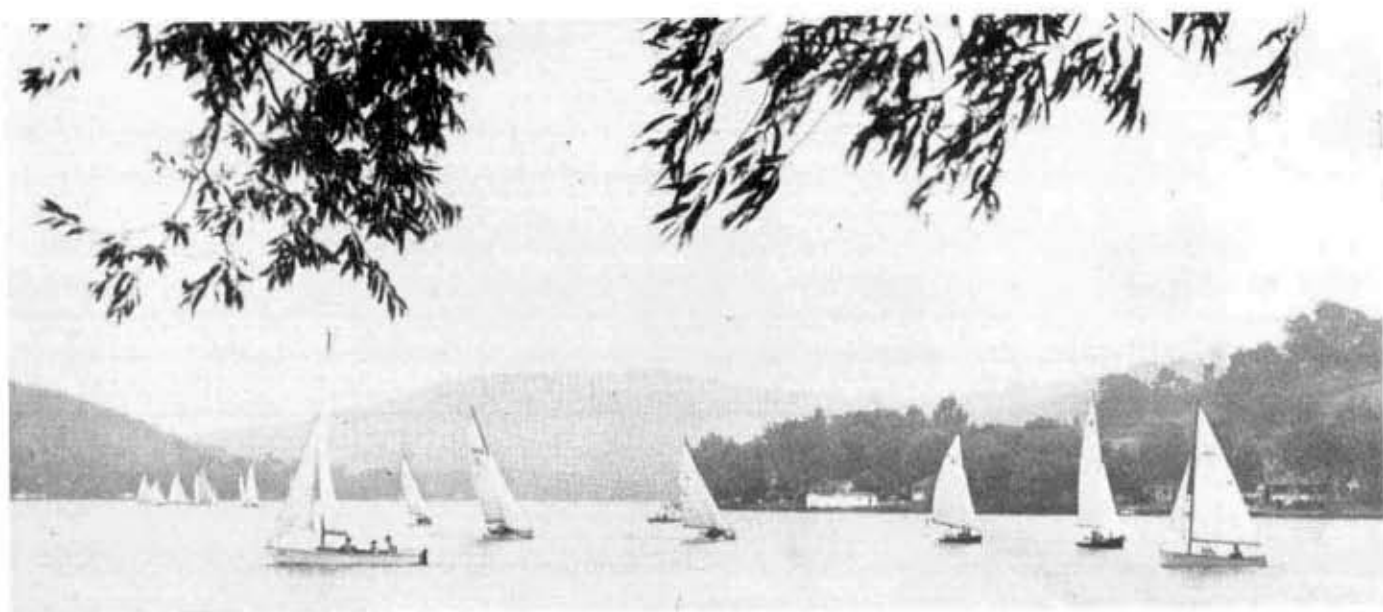
Cuba Lake Fleet No. 115.