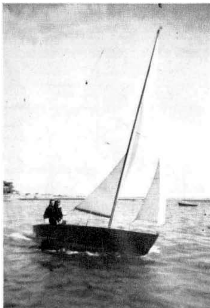
Sandy Poindexter in "Restless".