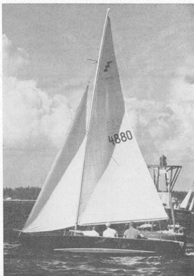
Dark Cloud rounding weather mark.