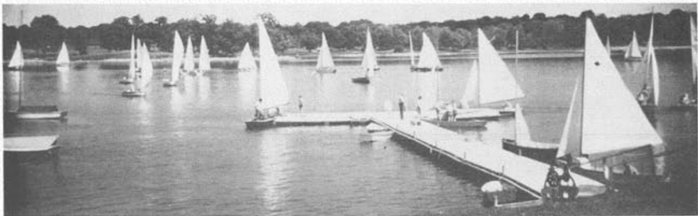
Just after the start at Leatherlips