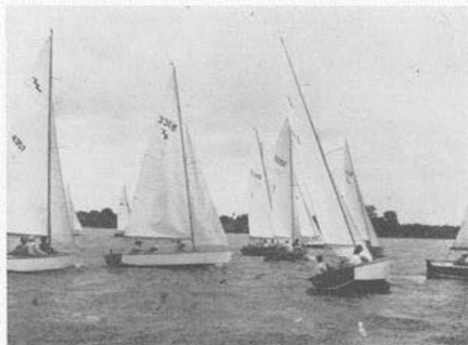
July 4th at Pymatuning