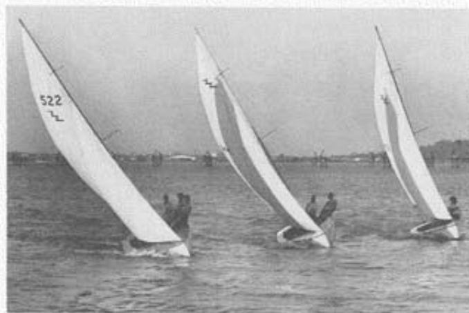
Fleet 50 boats in a nice Spring breeze. From left to right are Roaring Fork, Temptress and Zip.