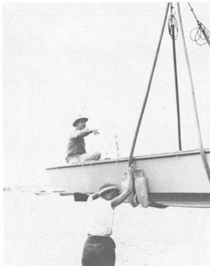
Lake Erie District Regatta

We tabulated results at the end of six races, because our