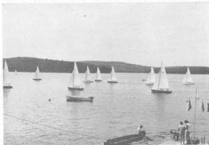
Fleet 16 on Lake Wallenpaupack, Pa., getting underway during one of its weekly races.