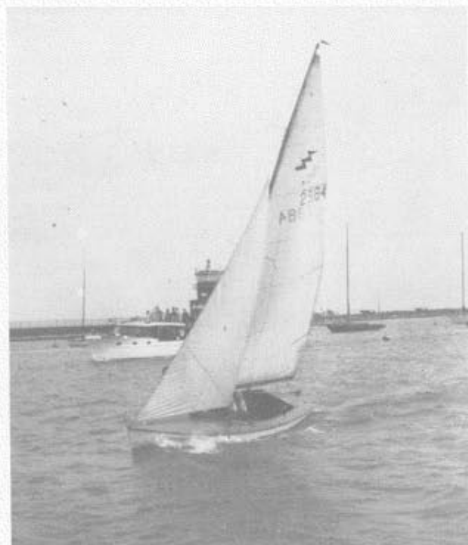
Alek Gimbut in "Shelst"