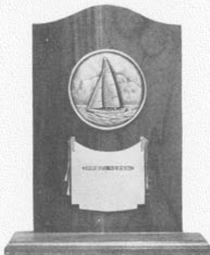
WW 14 3/4"x11" Walnut Finish Price ..... 15.50