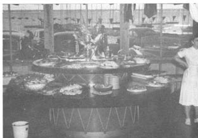
Lewis Point Regatta Banquet

The Seventh Annual Lewis Point Regatta was staged August