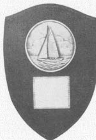
RR 3"x9 1/2" Walnut Finish Price ..... 8.50