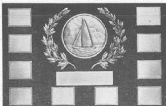
CC 18"x12" Mahogany Finish Price ..... 34.50