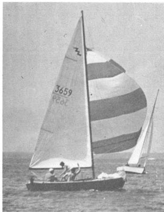
Flying Carpet rounding the mark.