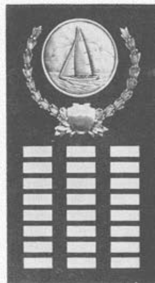
BT 18"x10" Mahog. Finish Price ..... 33.00