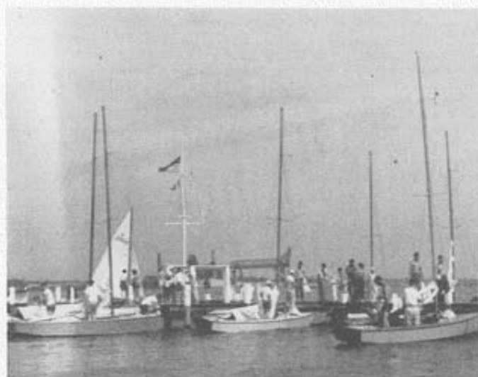
Niagara Sailing Club—Fleets In.

Next year we look forward to seeing all of our old friends again from the neighboring yacht Clubs and hope to meet some new friends, too. Another year should bring more good sailing and good times for all the Lightning sailors.