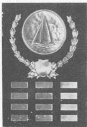
UU 14x10" Mahog. Finish Price ..... 24.50

Original Disk Designed by Cliff O'Kane, Fleet #148