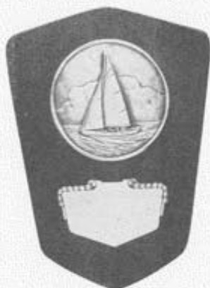
AB 12"x9 1/4" Walnut Finish Price ..... 8.75

Be Sure To Add Code Letters and Size—Allow 3 to 4 Weeks Delivery Time