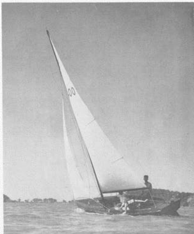
An Old Timer Still Going Strong Fleet No. 77, Rochester, N.Y.