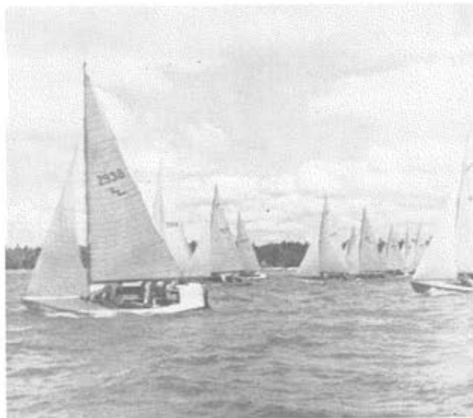
Start of the 3rd race at Higgins Lake.