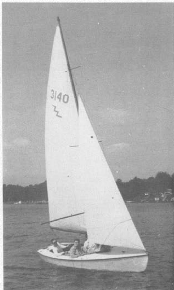
"Kibitzer passing under lee of N.O.D. in Chesapeake Bay Regatta"

The fleet officers this year, as in past years, have tried to attract interest with swap boat races, watermelon races, cruises, and meetings. The interest just isn't there and it hardly seems worthwhile to develop it. (Several Lightnings did get a workout in the Potapskut regatta in June and in the men's and women's Chesapeake Bay Area eliminations.) Active fleet members are going to try to stir up interest again in 1955.