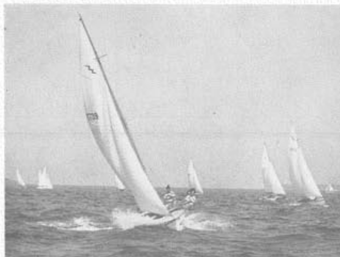
New England District Championships Marblehead, Mass., July 1954

sailing good. The Spofford Fleet No. 145 was the eventual winner but our sailor friends from Hewlett say, "Wait 'til next year." July 25th saw the start of the August Series which also was to determine the Fleet Champion.