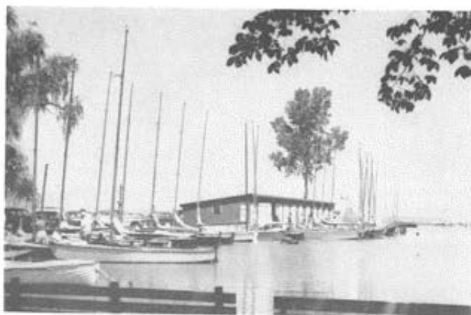
Getting ready, at Regatta, Fleet No. 136 and Visitors.