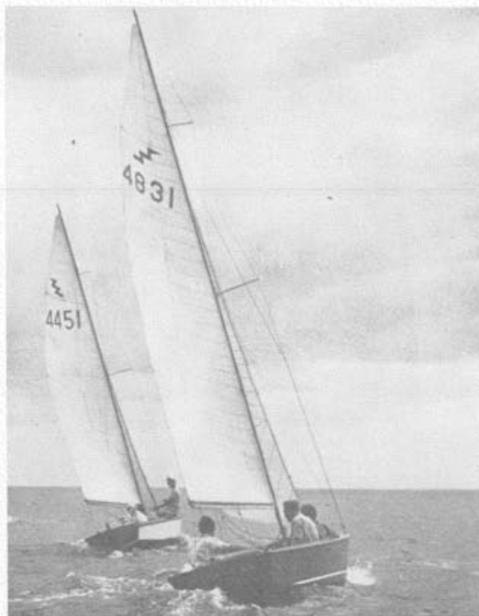
'Overtaking' Fleet No. 146 Toronto Bay

The past season was one of the best on record for the Toronto Bay Lightning Fleet.