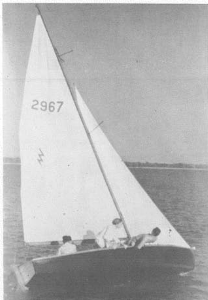
Fleet Champion "Trade Winds" with new dacrons in action.