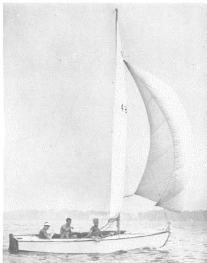
The Scud—Winner, Fleet No. 151