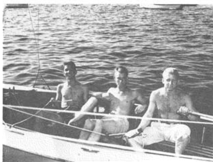
Fleet 151 Champions, Stardust's Crew.