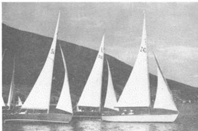
Part of Fleet 169 rounding a mark.

Like in other parts of Switzerland, Year 1954 can be described as a new birth of the Lightning-Class over here. For instance, on our three lakes, 3 Lightnings entered the 1952 Sailing Week, six entered in 1953, and fourteen in 1954.