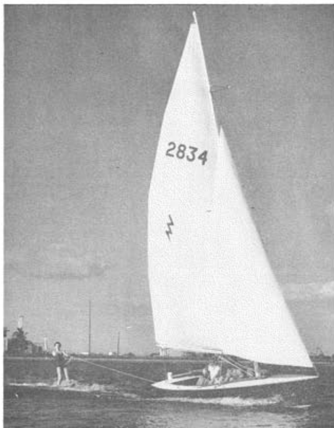
Don't look now but somebody is following you.