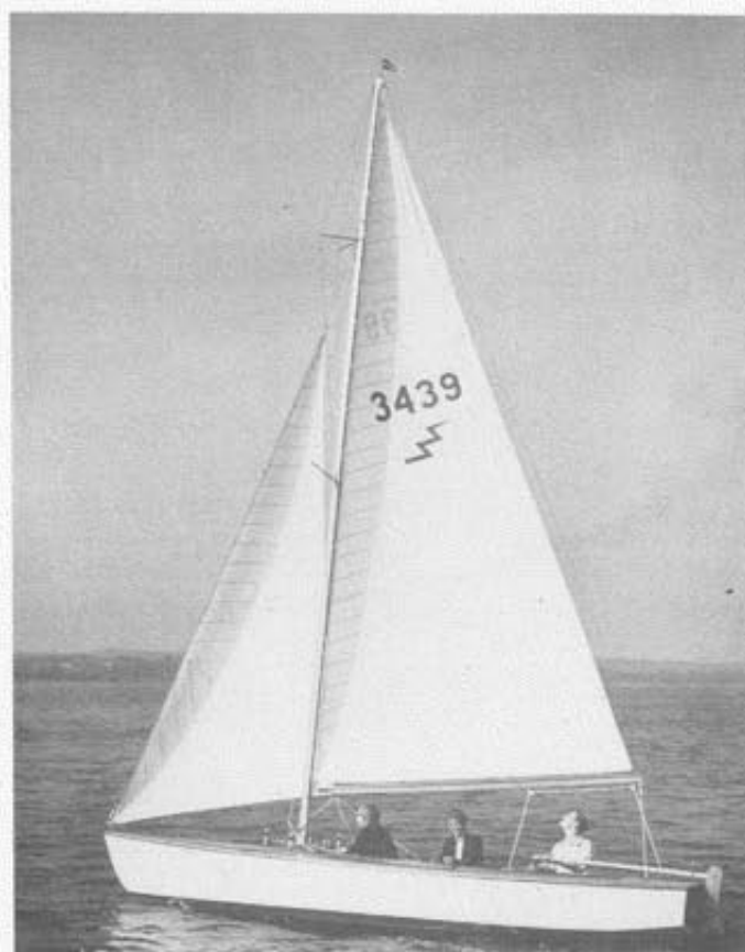
Jamie Maconachy in Folly. Champion of Fleet No. 192