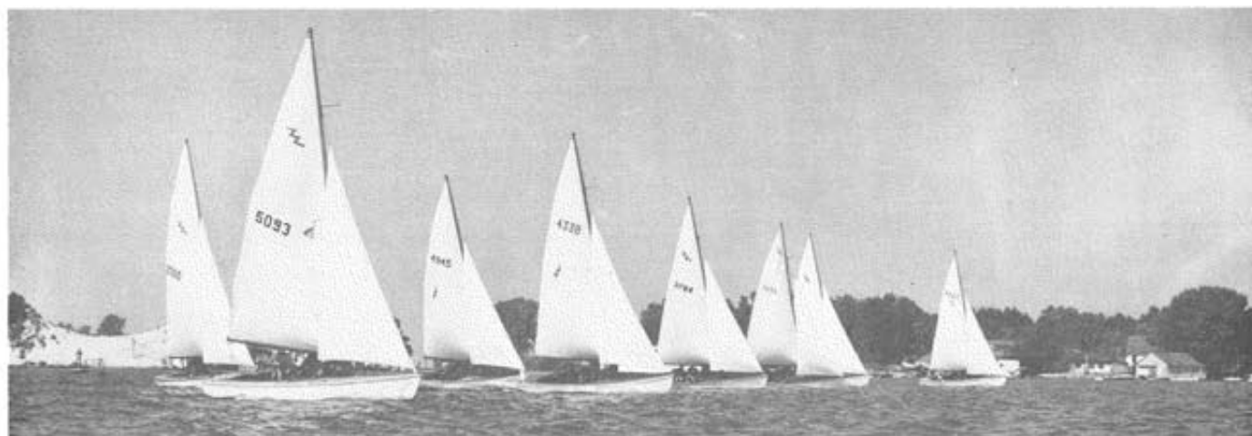
Start of the Sears Cup Series for the North American Junior Sailing Championship using M.Y.C. Lightnings.