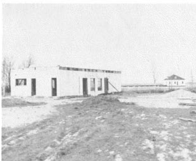
New Home of Tawas Bay Yacht Club.

Work is progressing on the new Tawas Bay Yacht Club at the slips on Tawas Point. Used as headquarters for the District regatta without a roof, the building is now closed in and will be ready for the annual Fourth of July Regatta in 1955—and you're all invited.