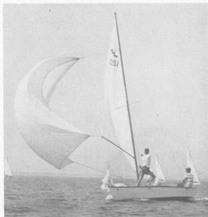
Get her down boy. That water looks real wet. Fleet No. 196

With the bang of the starting gun on the first day of racing in the 1954 season, the skippers of Fleet 196 knew that the finishes would be close in the races to come. The sight of our new clubhouse was enough to make anyone want to get back quickly, but