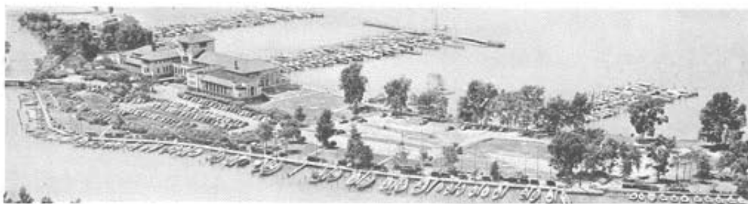
The Detroit Yacht Club