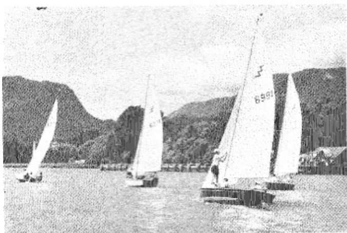
Swiss District Championship race.