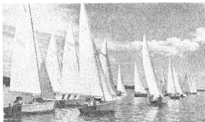
Waiting for the gun at Fleet #110, Higgins Lake, Michigan. 9th Invitational regatta.