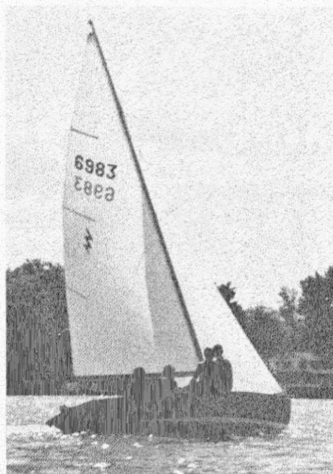
"See Adler" on a practice run.