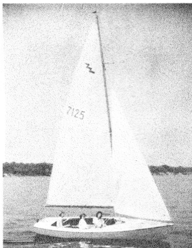
"Spook" ready for cup eliminations.