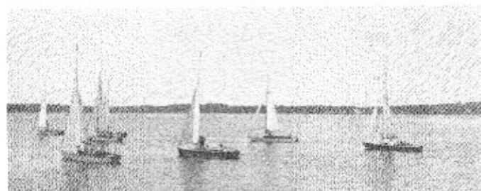
"Part of Fleet 116 at sea."