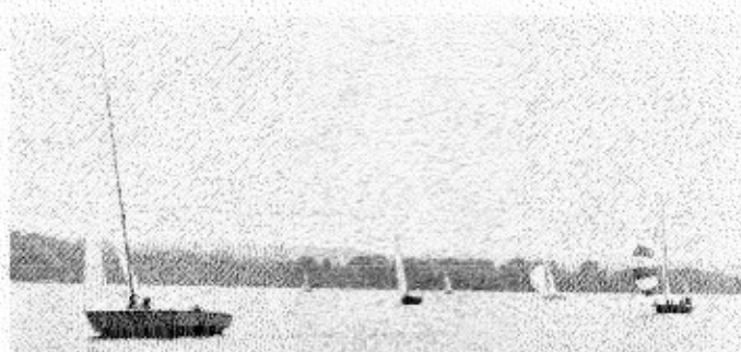
Spinnakers vs. Jibs, L.Y.C. (149) Invitational.