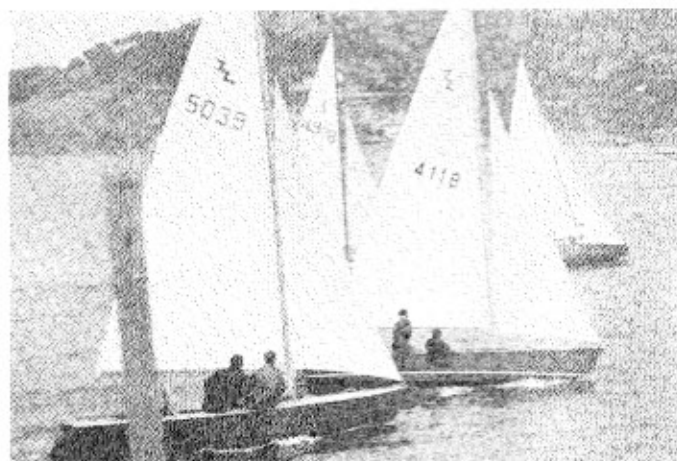
La Spezia Fleet 321, Italian District.