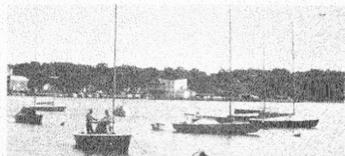
"Fleet #294 Saugatuck at anchor"

No change was made in the Fleet Officers this year. As the fleet is still "young and growing", it was decided better to wait until next year to elect new officers, as well as engage in inter-fleet competition.