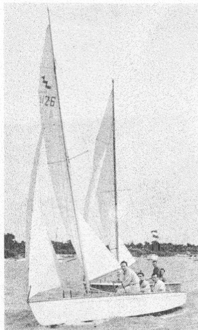
Huayna—The winner of Inauguration Trophy.

The great number of these boats that can be seen on its waters clearly speak of the enthusiasm that exists among the Rosarinos for this kind of boat.