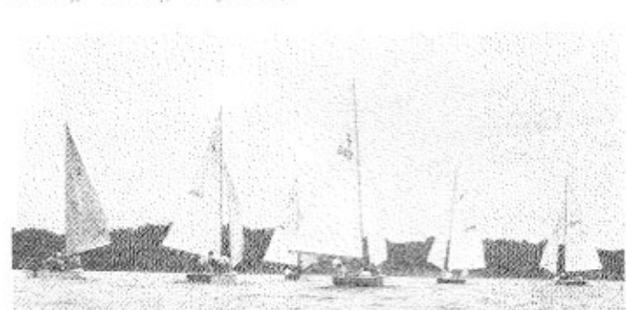
Odd Winds Fleet—"Six in a Row."

Planning for the season will be done in a series of monthly meetings starting in January.