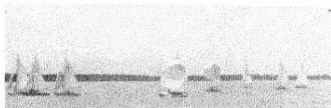
"Rosario" Lightning Fleet—Sailing on Paraná River.