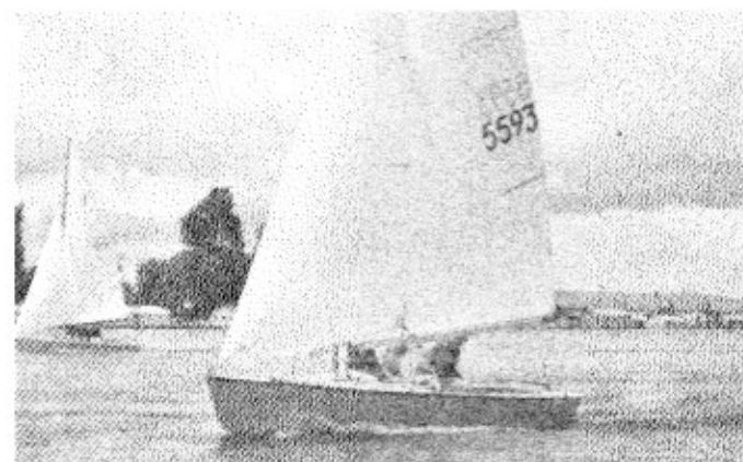
Going up river on one of our weekend Fleet 283 cruises, Bob Webb and crew.