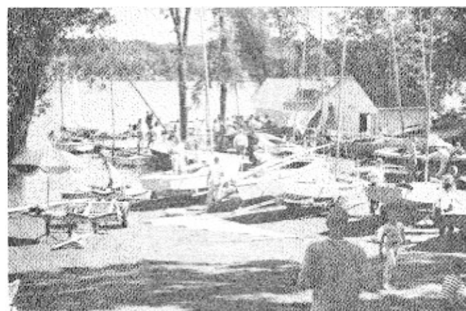
Silver Lake Yacht Club—Harvest Regatta

Sure hope to see more of you Lightning skippers at our Snowball in '62.