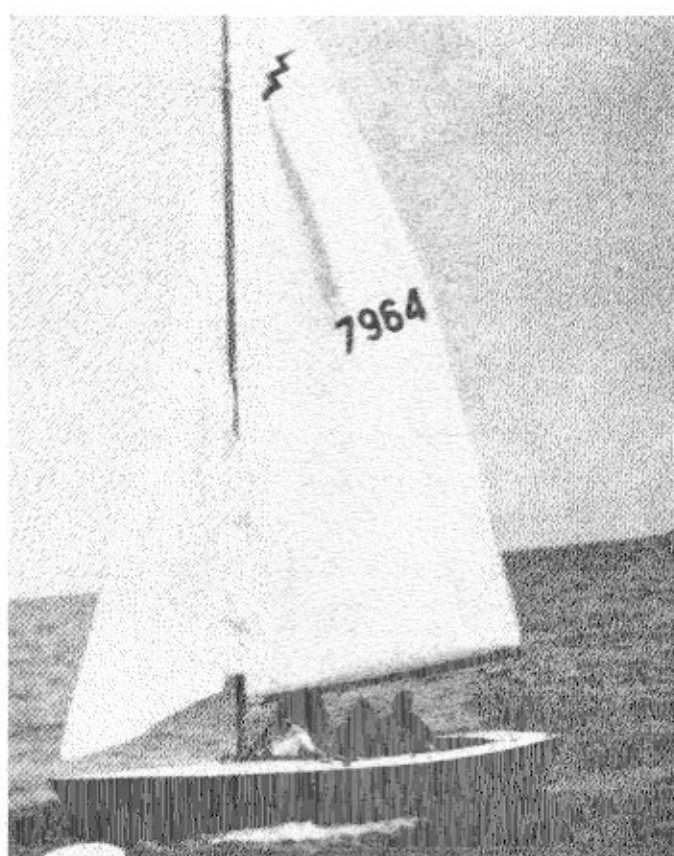
"It appears 7964 is being back winded by the outboard!"

This year has been such a banner one that it seems too much to hope for a bigger and better one next year. But there is no reason why it should not be. Let's try!