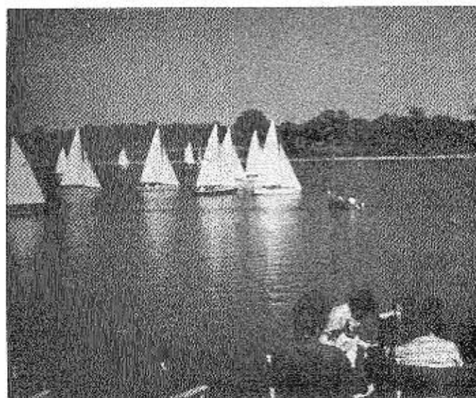
Start of the Fall Series at Leatherlips