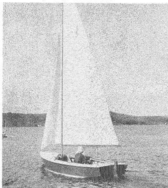
Can you top this one? Boat #20, Old Glory, has a good racing record and still all wood, no glass

This year proved to be a most successful season for the Pettipaugh Yacht Club members, with the Lightning Class being the devoted and dedicated group of sailors that they are. Although we may be small in number of Lightnings sailing in comparison to other Yacht Clubs, we are most encouraged by the tremendous spirit, enthusiasm, sportsmanship, loyalty and fellowship displayed here at Pettipaugh. We believe we have one of the finest sailing groups one could find anywhere. With this we look forward to another season and know we will have additional Lightning members soon.