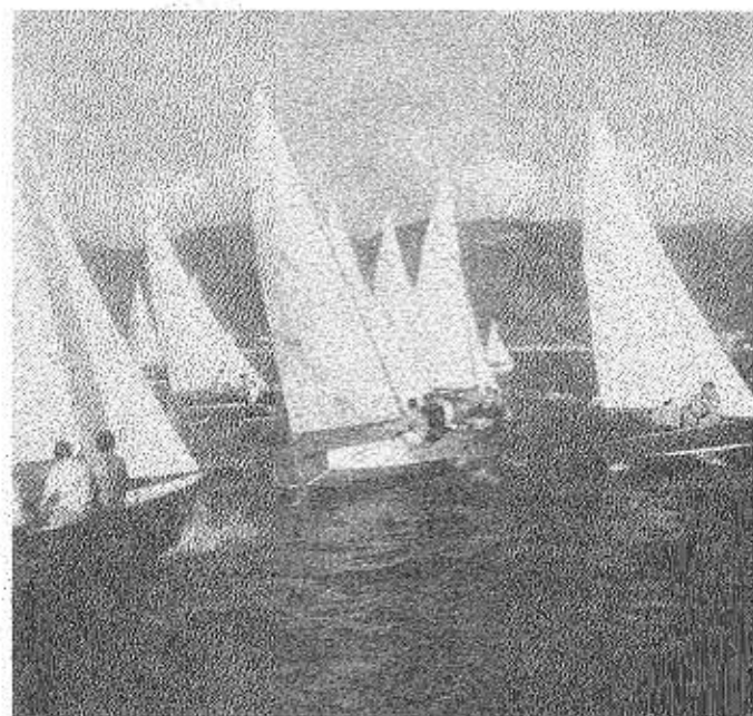
Start of the first race organized by the newest fleet in Brazil

All our endeavours are being conducted to have all the boats of the fleet measured before the end of 1962.