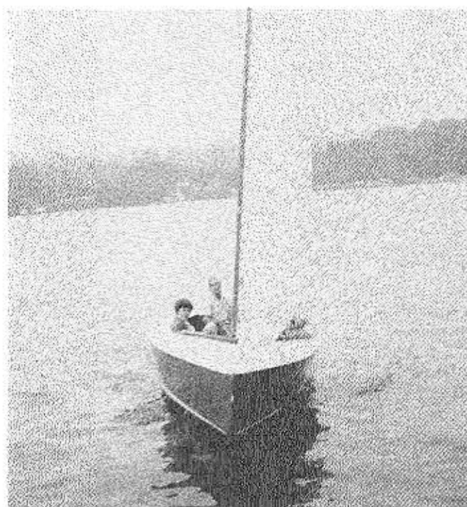
#6318 returning from Labor Day drifter on stiffest breeze of the day