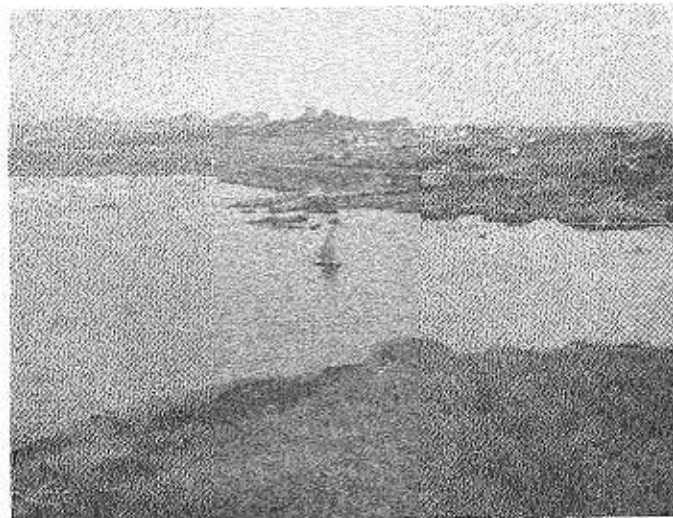
Pichidangui, Chile, South America—Inner Bay with Yacht Club in foreground

It was during Easter week that in accordance with the Chilean Yachting Federation, the National Lightning races took place in Pichidangui Bay (135 miles north of Santiago) on the Pacific Coast.