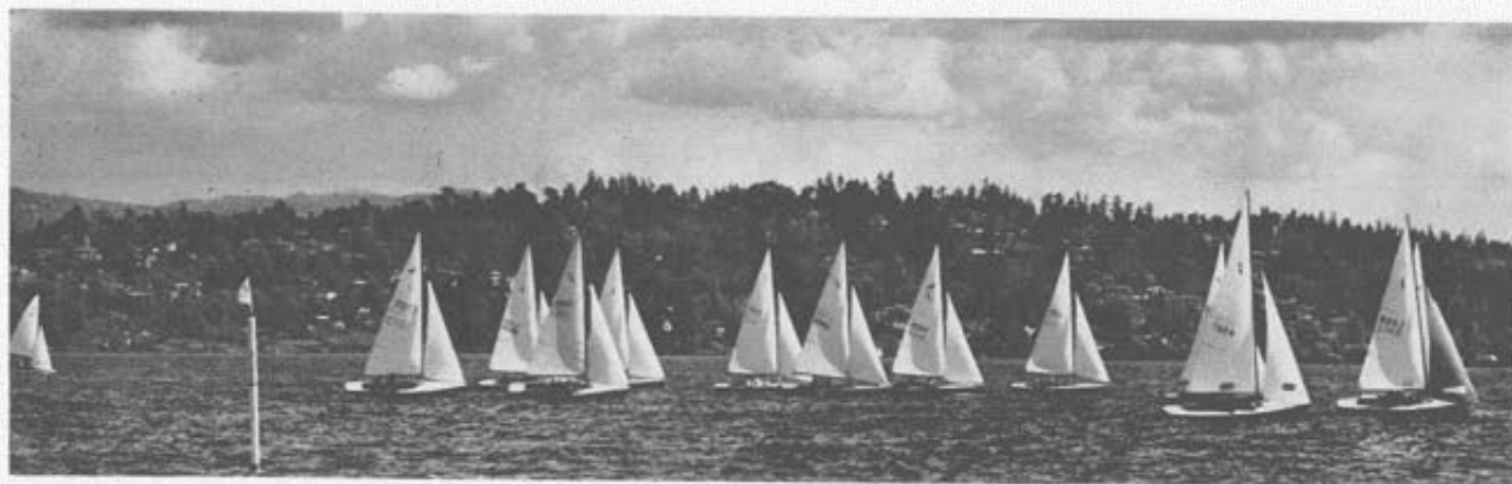
"Opening Day Fleet #132"

With the sailing running from March to December we realize that there is not much time left for resailing past races or for winter maintenance; particularly since we each know that the competition is already plotting for next year.