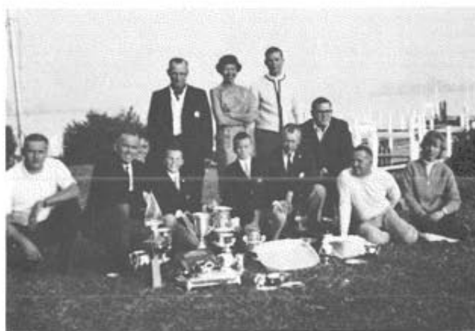
"Proud members of Fleet #43 display their seasons Trophies".

After the end of the 1963 sailing season Fleet 43 undertook a major project. Our fleet held two classes on rules and tactics from November through April, one a basic class, and the other an advanced class. The classes were open to all sailors in the area. The attendance was exceptionally good, and the nominal charge per individual also increased our fleet treasury. There are plans for continuing the classes during the next winter months.