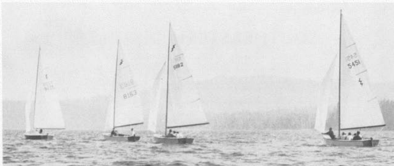
"Some of Fleet #370 on Sunday sail on Howard Prairie Lake, altitude 5000 feet"

Fleet 370 is looking forward to good racing in '65 and invites anyone with a yen for camping to "come sail with us" on Howard Prairie Lake.