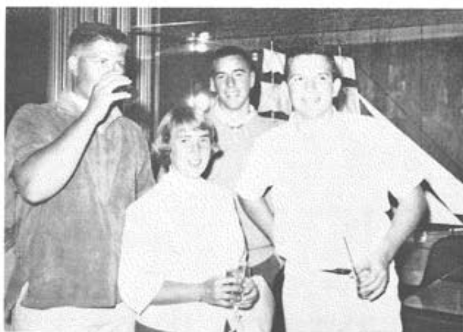
"Celebrating Champion and crew of Pacific Northwest District."