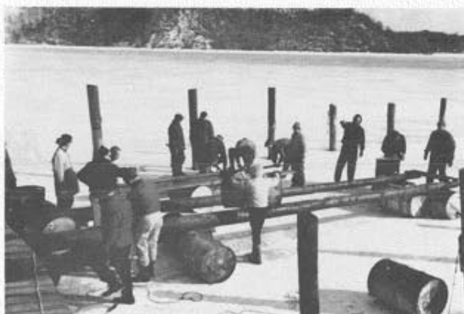
"Hard water work!"

This year's activities began with last year's fall work party when we hauled out one of our docks. During February and March, with the bay frozen to a good fourteen inches and the Saturday temperatures ranging in the thirties, the fleet rebuilt the dock while the children had weekly skating parties. Included in the winter's activities were three sailing seminars with guest speakers Wally Ross and Stu Anderson.