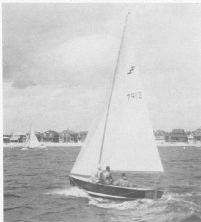
"Fleet #105 Champion David Hadlow and crew."

Fleet 105 experienced a very enjoyable season. Our Fleet of Lightnings is growing as a result of skippers graduating from the popular Blue Jay Class.