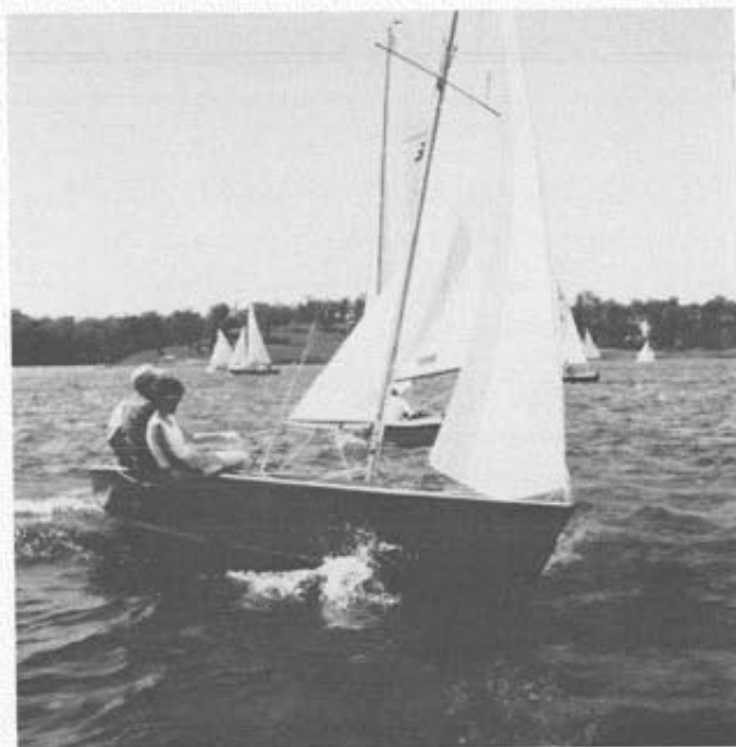
"Some 'pretty' hiking by Odd Winds Fleet 296."

With more experienced sailors, we look forward to an even stronger season in 1965. Several boats are now changing hands, and we are getting new members. Whether we maintain our 2 fleet system, or return to one fleet competition, will be decided when we count noses next spring. In any event, the year 1965 should be eventful!