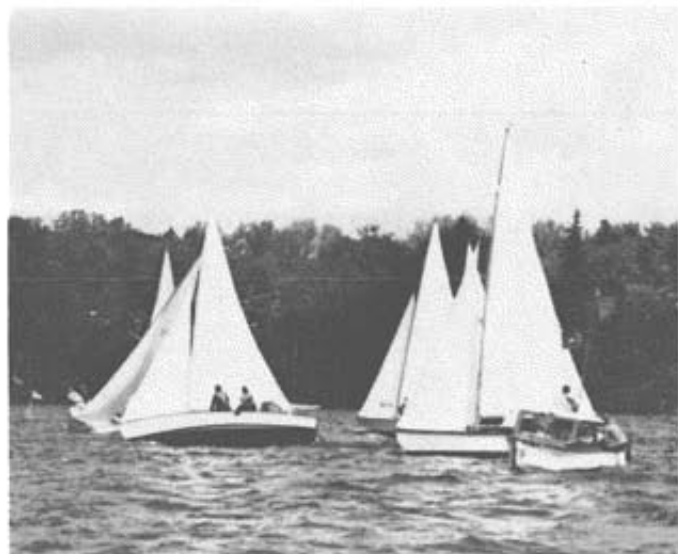
"Four seconds after the start. Starboard!!!!"

Continued growth of the fleet and enthusiasm for racing seems assured for 1965.