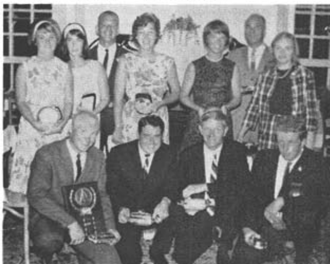
"Prize winners of Fleet #99 (see text)".