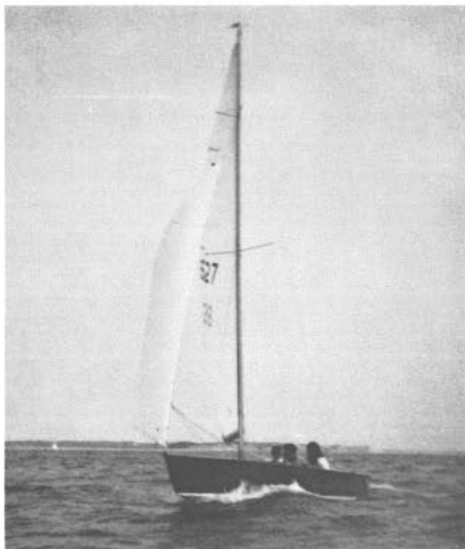
"Fleet Champion Nickerson in WINSOME II."

Several members of fleet #280 are planning to attend more New England District races in 1965.