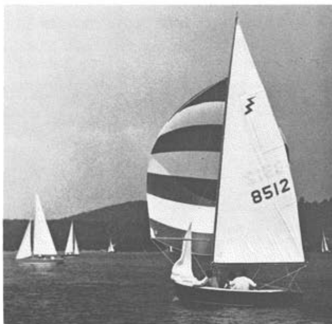
"Fleet Champion VIGILANTE"