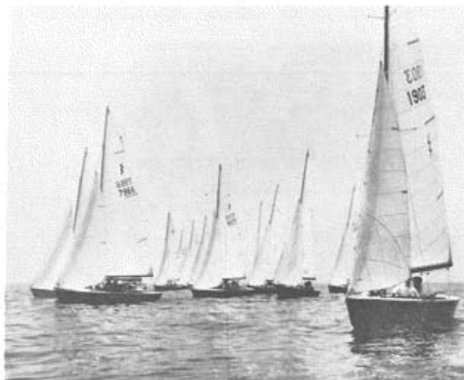
"Start of another drifter during Fleet 113's Shakedown Regatta"