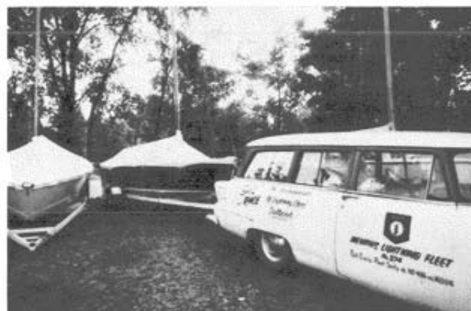
"Every Fleet should have one!"

We, in this fleet, would thank the well run ILCA and particularly the boat builders for all the help and assistance they're giving us in expanding our Fleet & District. Good luck to you all and come to the Cotton Carnival Regatta in May.