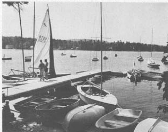
"Overlooking moorings—during New England Championship Regatta."

With all these activities, our new club house and the overall development of the water front added to the convenience of our visiting sailors not to mention us regulars.