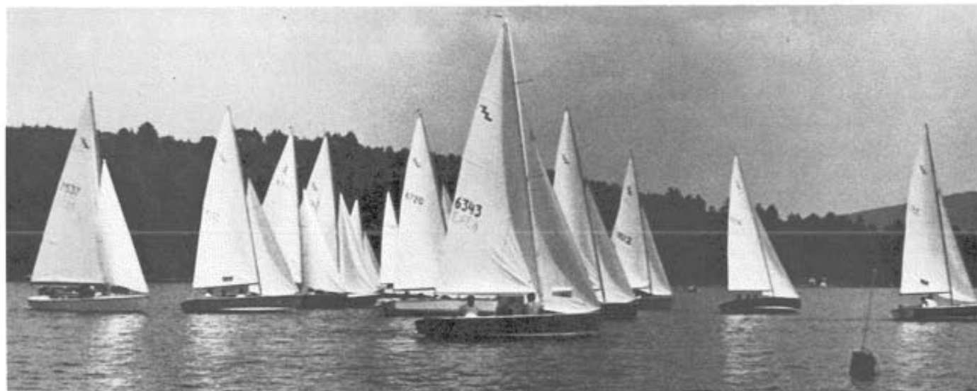
"Start of the 1st race of the New England District Championship on Lake Spofford, N. H."

Your scribe would like to take an extra paragraph to pay a small tribute to the Lake Spofford Fleet. They are the travelingest bunch in the District, and their large attendance at most of our regattas has helped to make the racing even better. This kind of support for the District shows that this Fleet is active and interested. How better can you develop your skill and improve the competition in general?