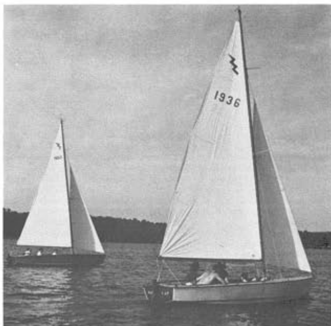
"Breecing along on Massabesic Lake."