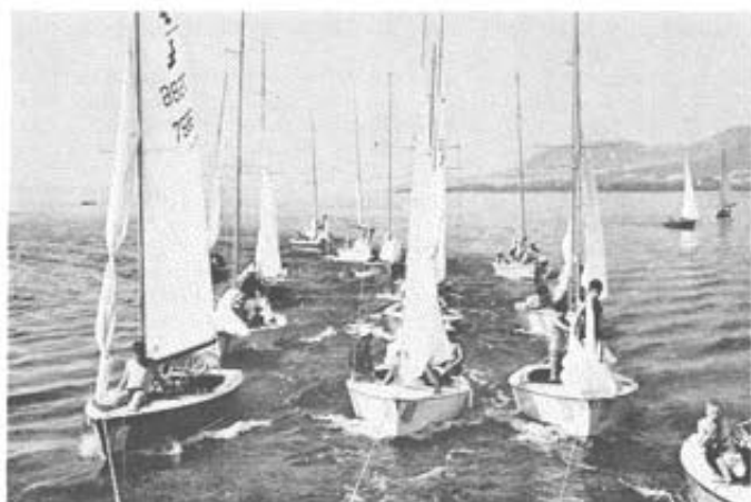
"Boats are towed back to harbor during European Championship in Neuchâtel. Race postponed—no wind."

Water is now boiling strongly in Neuchâtel Lake as 1965 will see the World Championship in Italy. We all will meet together over there.