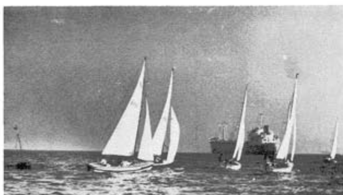
"Turning the mark during national Championship; Callao, Peru"