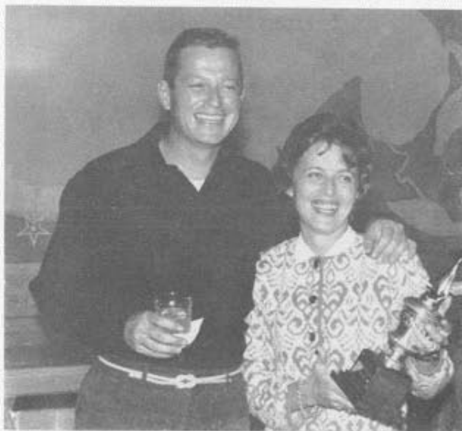
"Happy, victorious but (alax) unidentified couple of Fleet #62".