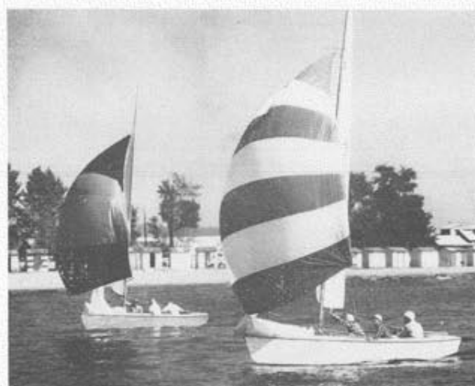
"Running in light air against a rip tide—Plum Point on Manhasset Bay."