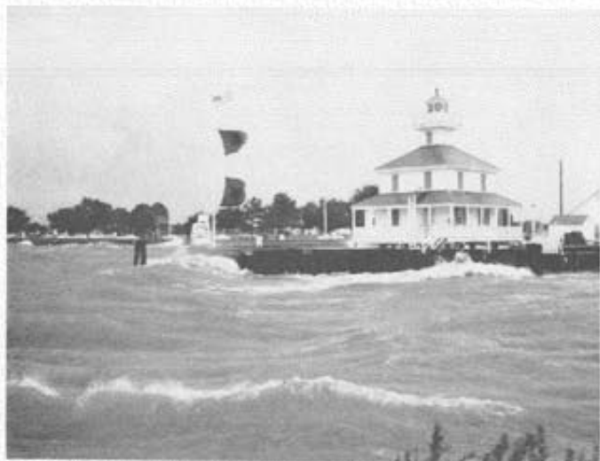
"Hurricane Hilda hits West End Light on Lake Pontchartrain, home of New Orleans and Southern Y. C. Fleets."

Southern Yacht Club will be the host, and plans are already being worked-out for one helluva big time for everyone attending.