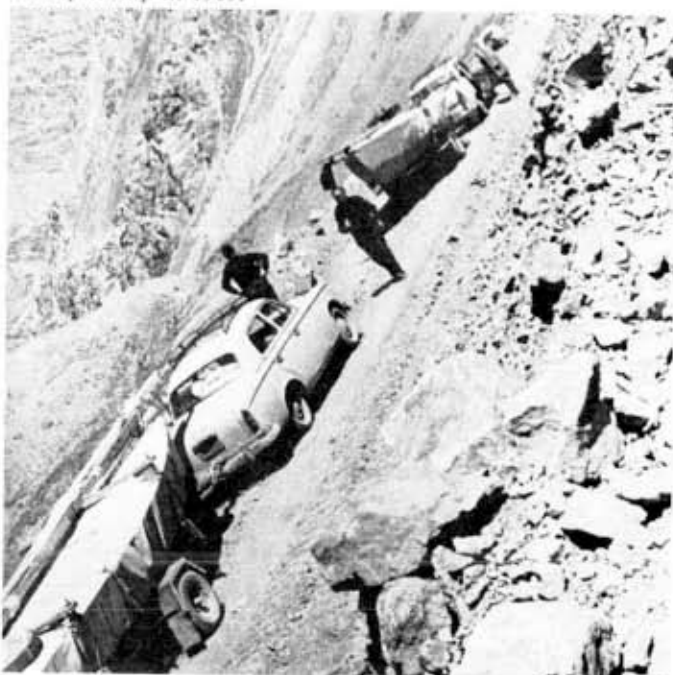
Some Argentine boat stops on the way to Vina del Mar, Chile. That looks like a very difficult road to pull a boat over.

Fleet 356, sent to I.L.C.A. the invitation to sponsor the V World's Championship in 1969.