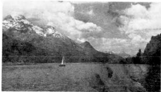
How wonderful it would be to sail on the beautiful waters of Switzerland once again. (asst. ed.)

Considering the activity of our members, 1966 was a remarkable year.