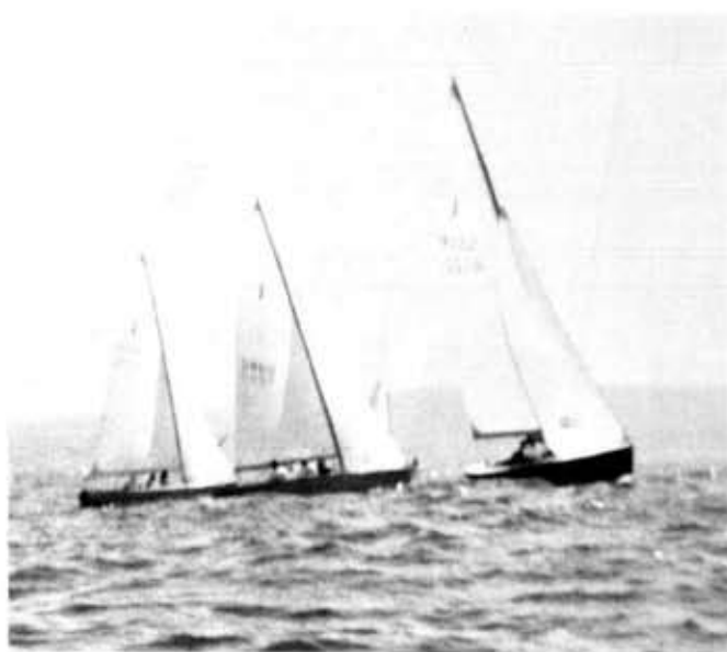
Screaming across the finish line at "Hurricane Gulch."