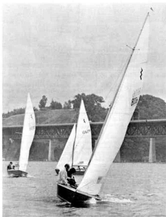
Waiting for the start.

Our 1972 season started early in March with a "Racing Symposium". It was a five-week course covering the subjects of: