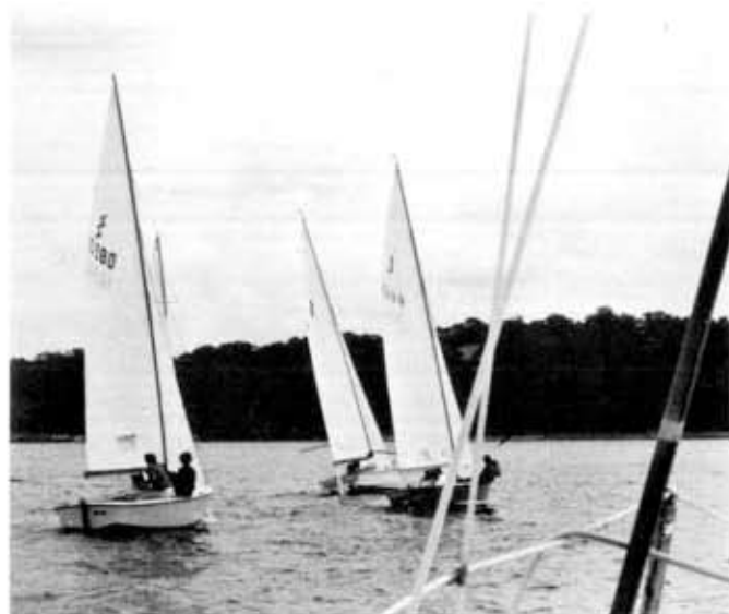
"My boat just never seems to point as high as the guys ahead of me."