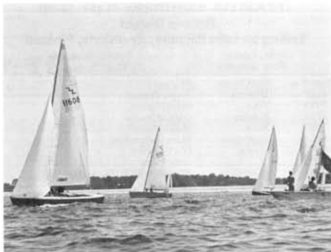
"Many races are won or lost at the start." (Who said that?)