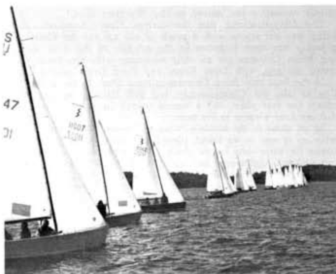
This picture is included for the enlightenment of race committees everywhere.