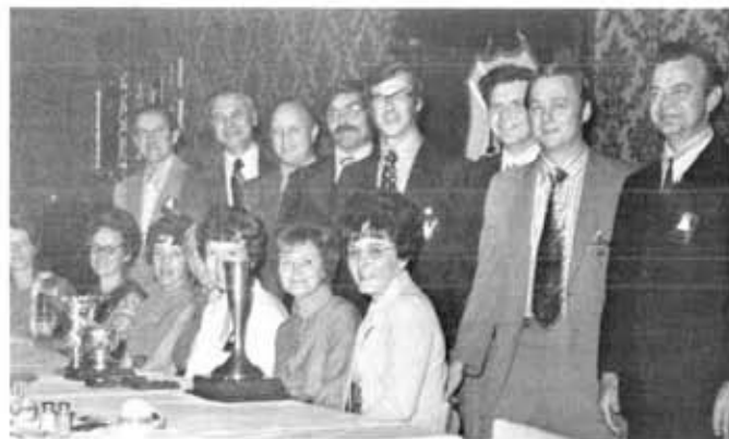
Skippers and crew, Fleet 442

"I knew my daddy was exaggerating when he said I couldn't possibly sail this thing by myself."