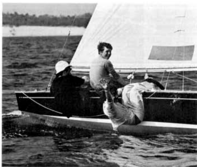
Shortly after this picture was taken this skipper received a 60° header.