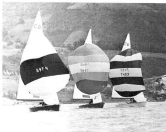
Spinnakers flying on Lake Tomine—in spite of the huge windbreak in background.