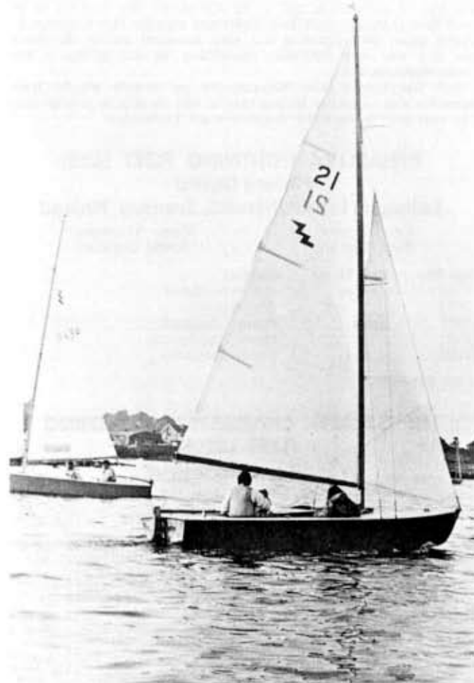
"Are you sure you're looking for the same mark I am?"

Fleet 426 has a terrific potential for expansion and a more active local racing schedule. However, we need more Fleet members to get on the local racing schedule as most clubs require five to seven boats for a class start. For those who enjoy trailing on weekends, meeting new friends, and sailing on a variety of interesting waters, the Dixie District Invitational circuit is hard to beat, and there are races almost every weekend from May through October.