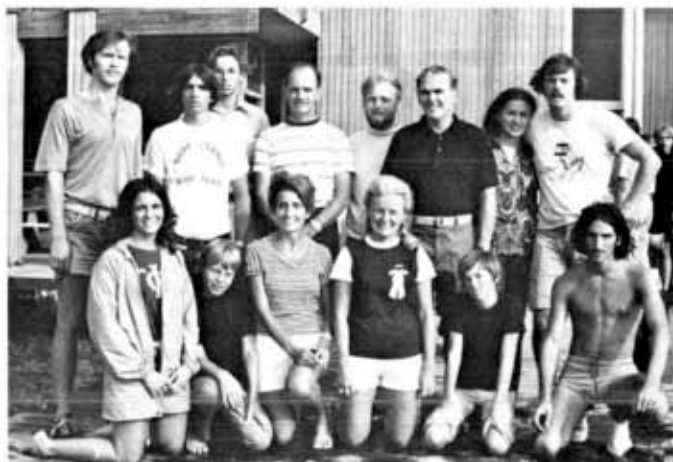
"You mean you're not the photographer from Surfing World?"