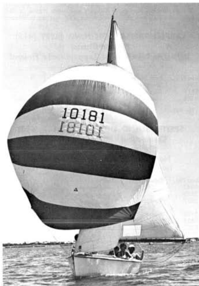
Spinaker drill (?) aboard LU TOO.