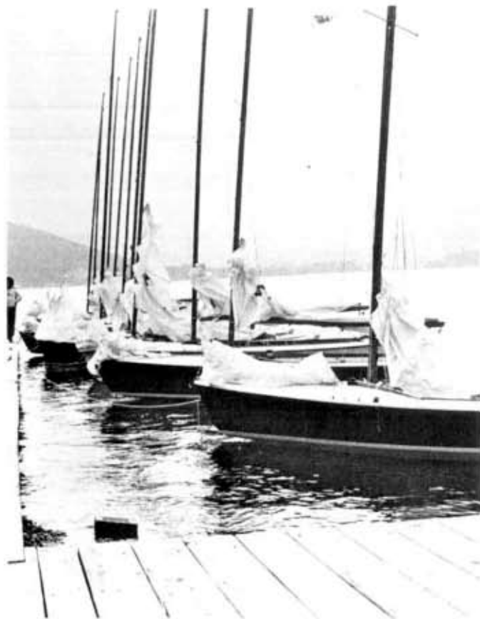
"There are just so many, I can't decide which I like best."