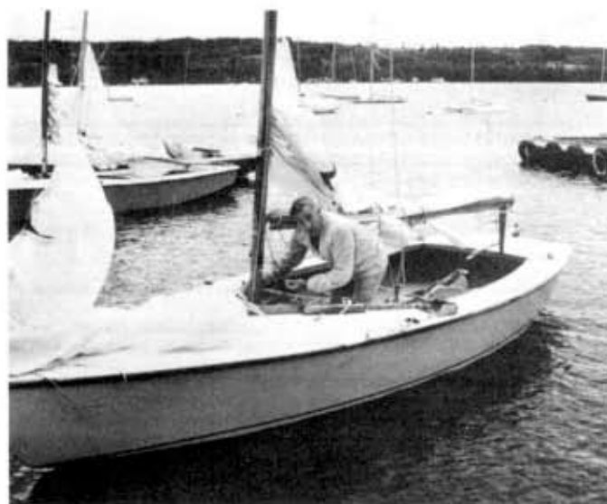
"I'd rather be selling!"