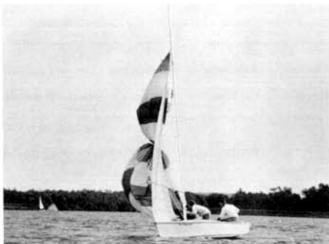
"Just wait until they look up!!"