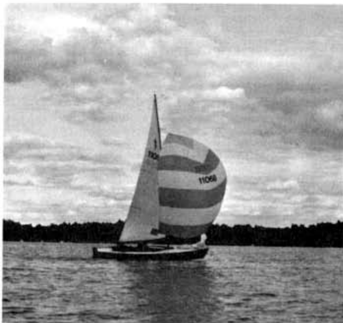
"Michigan Junior District champ Dave Aloisi and super crew showing perfect sail trim."