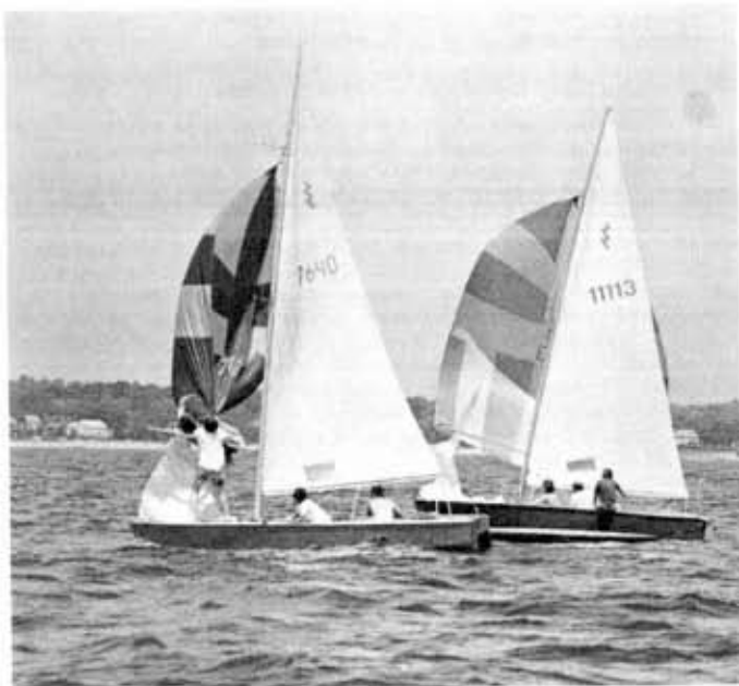
Untwist it ---- it — don't hug it!