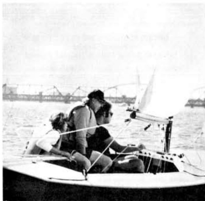
Just shows how intense the racing gets in Fleet 167.

An unusually dry spring provided an earlier racing season than can normally be anticipated for sailors on the Mississippi River, with the first Lightning race held at Lake Davenport on Memorial Day and the first race of the summer series held the following Sunday, June 8, 1975.