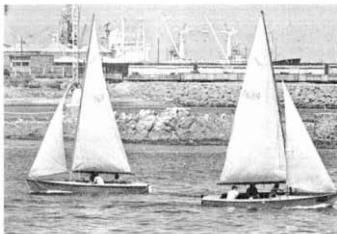
The Andino and Flash going up and down.