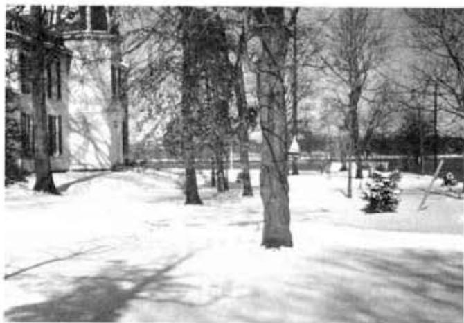
"Red Dragon Canoe Club wrapped up for the winter."

Certainly this can go down in the record book as a good year for the Red Dragon Fleet.