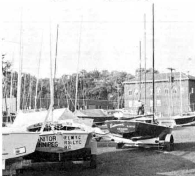
Must be a pre-launch party someplace.

Fleet 311 experienced a second successive lethargic season in 1975. A few times during the summer two or three Lightnings participated in the Sunday races with the keelboats of the Dunkirk Yacht Club, but the only all-Lightning race during the entire season was the annual Dunkirk Regatta held on the weekend after Labor Day.