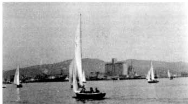
La Spezia harbour.