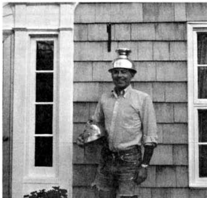
If this is what 2nd place does, what happens to the 1st place winner? The Fleet article says he "wasn't available for photography" Hic!