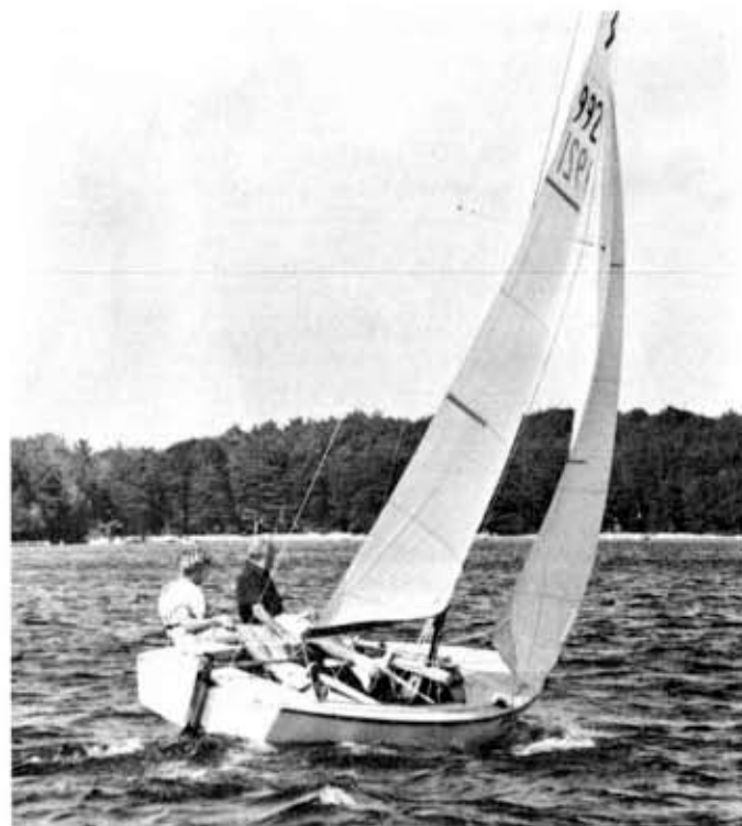
No wonder this father-son team wins — there's only two of 'em.