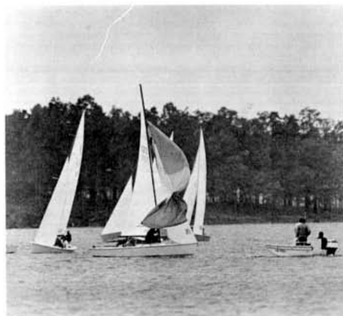
If we don't hurry and get this thing untwisted we just may compromise our position! — Atlanta Cup