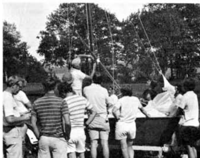
This thing is supposed to be the most, but on this boat I'm not so sure!