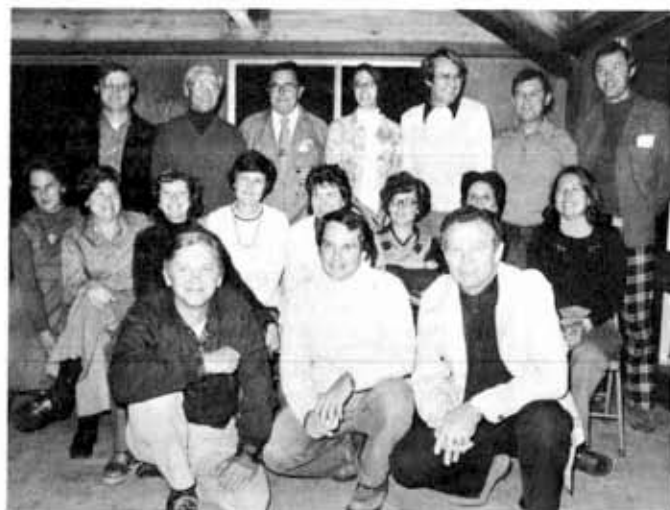
What did he say?

"The racing schedule consisted of 25 races sailed between April and October. Our new fleet champion is a newcomer to Lightnings and to racing. He has gained proficiency in a very short time, having purchased his Lightning in mid 1973.