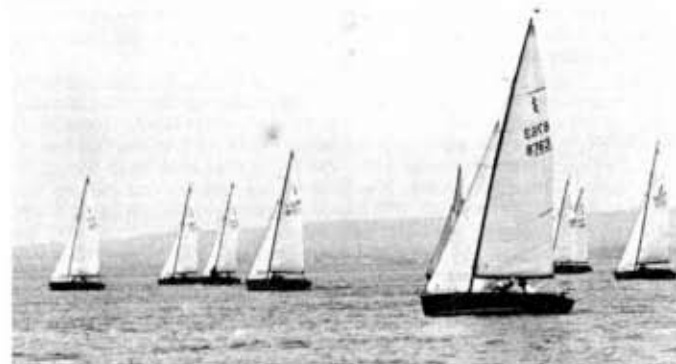
"#12556 looks in pretty good shape — if he doesn't get a "header"!"

Among the most important events of the season was the Siculo-Calabro Championship with the participation of more than 10 boats; the Coppa Marinella; the Pernice-Piccione Trophy and many other social regattas.