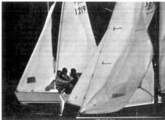
Starboard vs Port at the Pacific Northwest Team Races on Columbia River 1976.