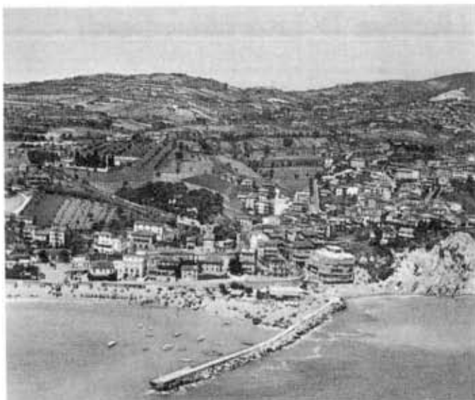
The beach at next year's European Championships.