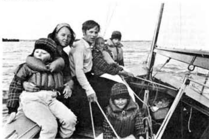
The ten years anniversary wedding-trip by L7178. Lightning sailors have more fun!

This was again a good season for fleet 456 and to guarantee the positive development we have planned the programme for crew training, in order to solve the problem of crew shortage. We wish this action will bring us more active Lightning Sailors and hopefully also some new boats.