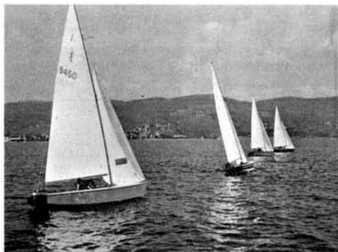
Undecided wind at District Regatta.

This year has been very important for the Lightning at the Trasimeno Lake.