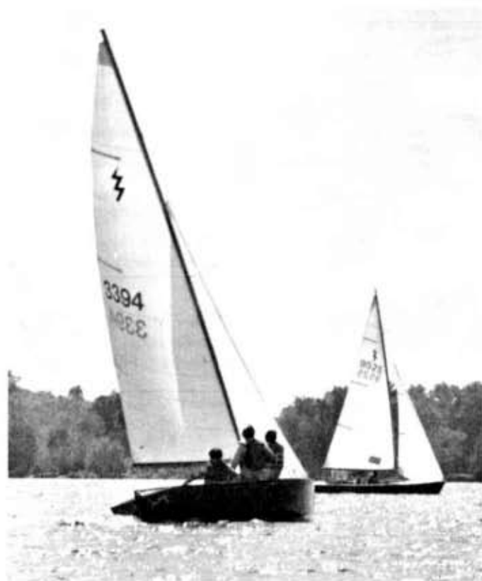
A LIFT AND A KNOCK??--OR VICE VERSA??