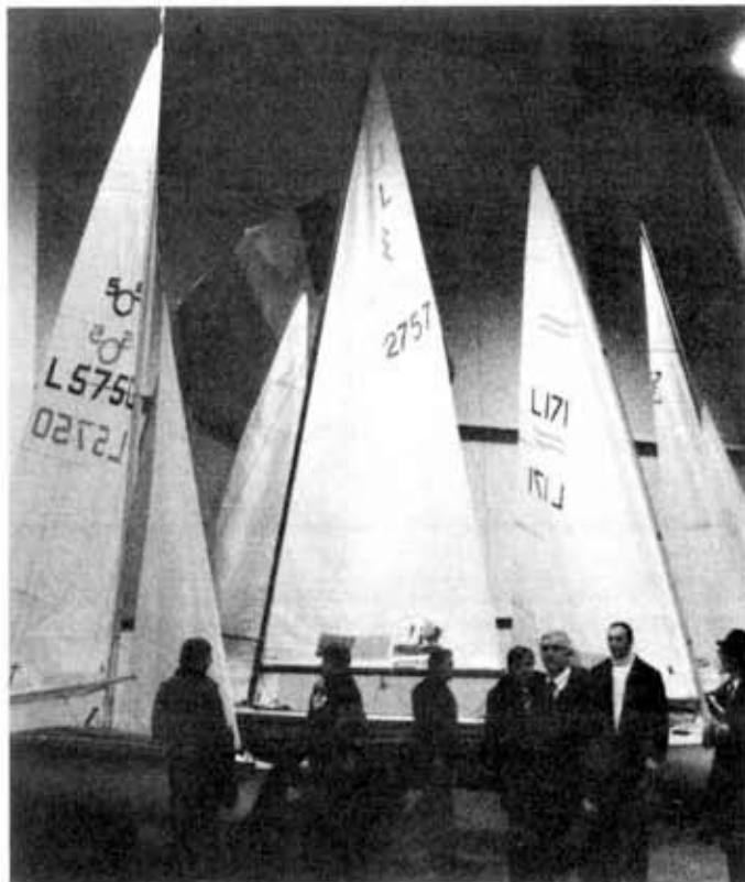
Helping to promote the Lightning at a Finnish Boat Show.