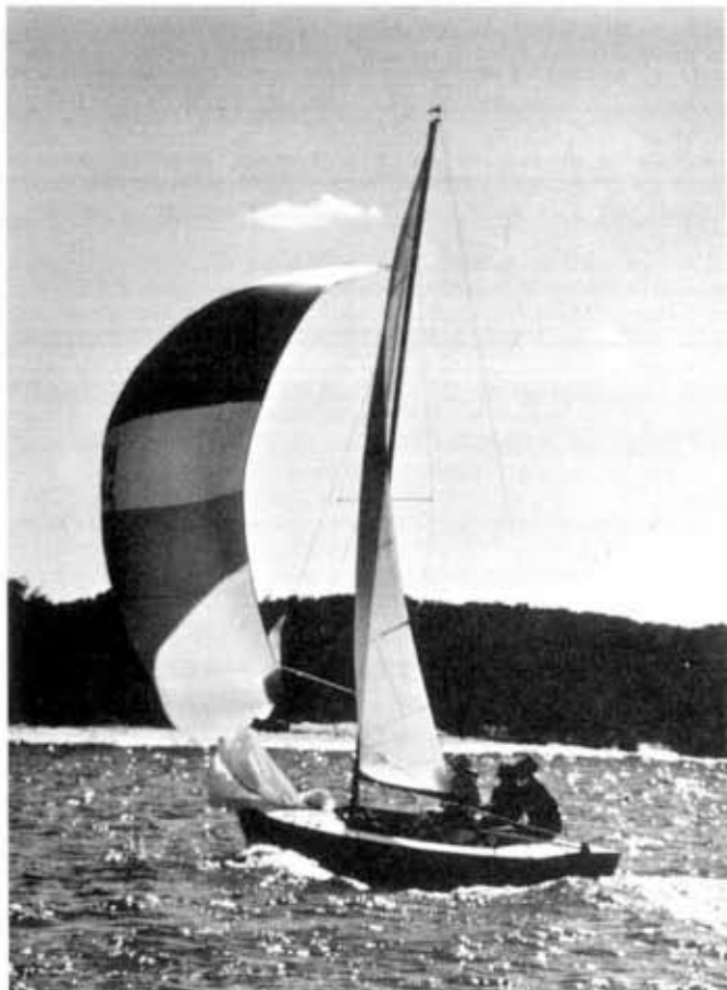
George Zabrycki and Crew.

In October the fleet, along with Myron Lyon of San Diego, sponsored a new Lightning in the Long Beach Sailboat show. There was much interest in the boat. As a direct, or indirect, result of the show, we have added two new members to our fleet. Next year we hope to have a larger turnout for some of our regattas. Now that there are two new boats in our area, and two or possibly three new members who have bought used boats we are anticipating a renewed interest in Lightning racing in the Santa Monica Bay area.