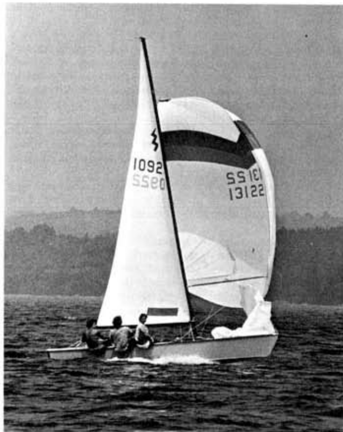
Jim Neville and crew in World Class form.

The summer of 1977 was marked both by keen competition on Lake Chautauqua and an increase in participation at outside regattas by Fleet 198 members.