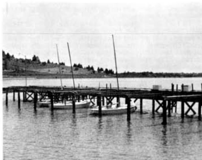
A dry year in Oregon.