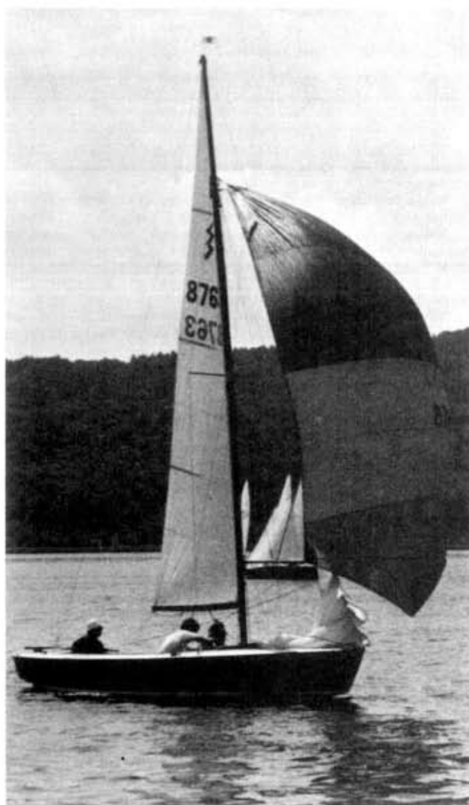
8763 Sindbad the oldest boat at the World Championship.