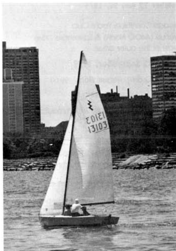
Fair sailing by Chicago's Gold Coast.

The safest prediction is that Fleet 5 will again provide full opportunities for all Lightning sailors and again be one of the most active fleets in the country.