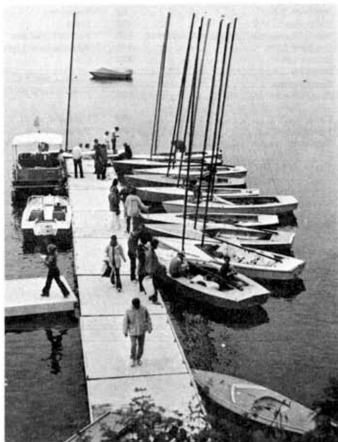
The scene at Lake Delta Yacht Club.