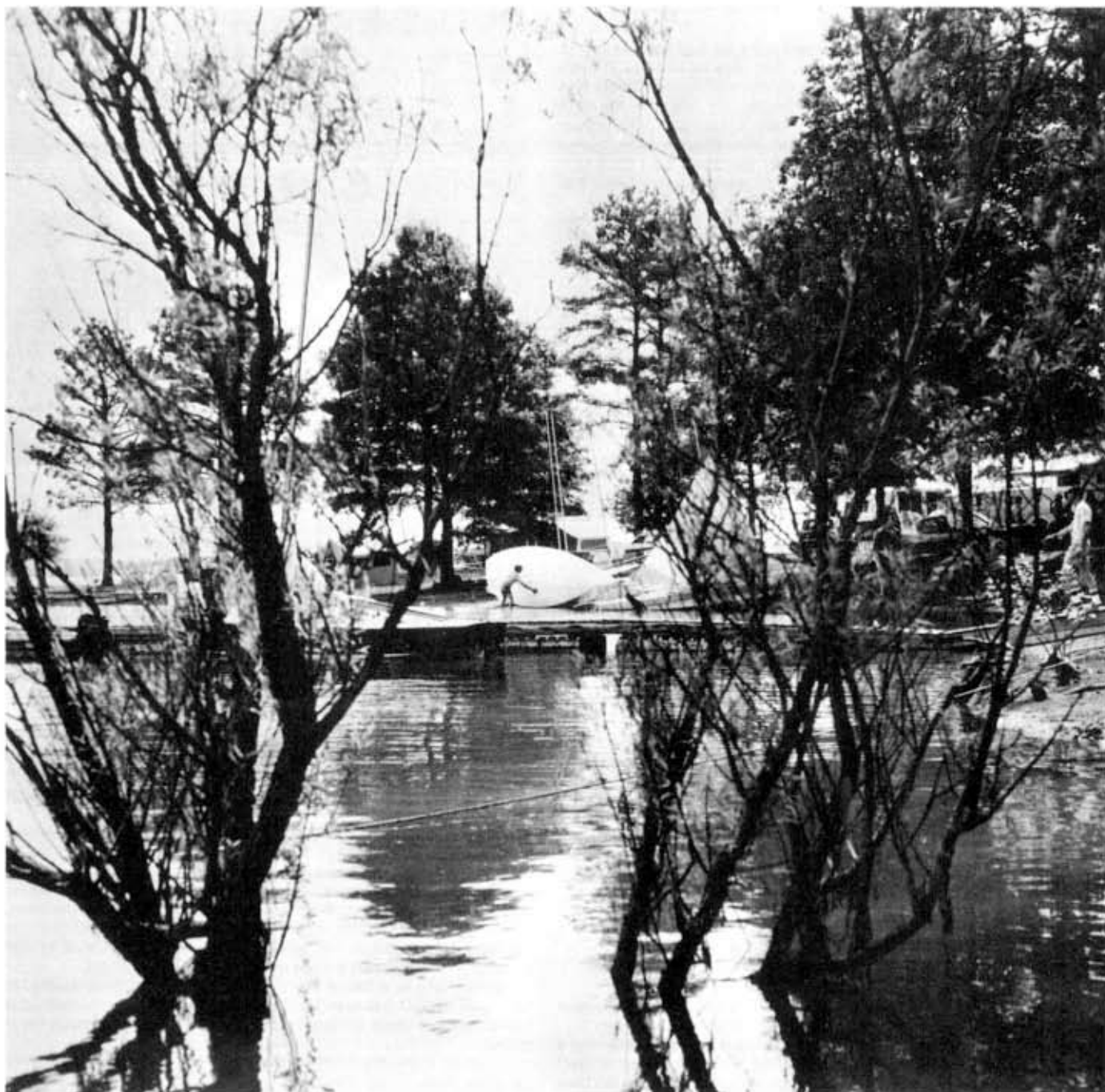
Spring is on its way