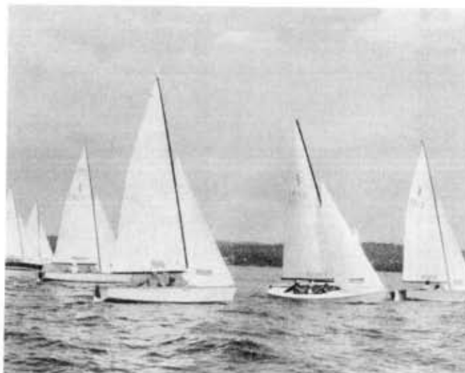
Part of Fleet 75 Maneuvering at the Start

Fleet 75's six month racing season of 28 scheduled races began on May 7, 1978. Two races were cancelled for lack of wind and two others were cancelled because of high winds and heavy seas.