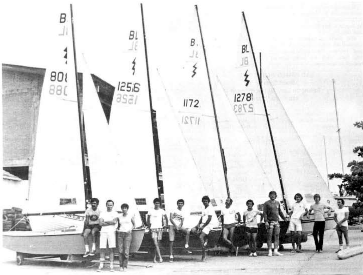
Members of Fleet 162.