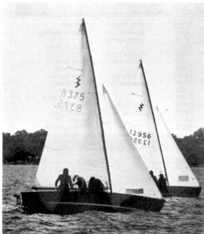
Close Racing on typical Sunday Series.