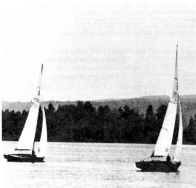
Light breezes call for light crews.

Temple Reef Sailing Club's year opened with the annual Kam River Slush Cup and closed with the Frostbite Regatta. Both names are very apropos as we start our season with the ice actually going out and end it as the lake starts thinking of freezing again. In between, we have had a wonderful summer and a lot of enjoyment.