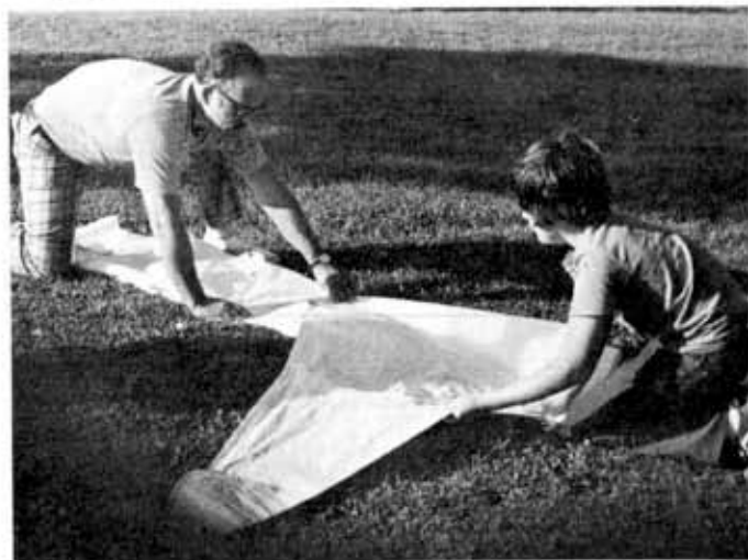
You're doing Nice Work, Dad.