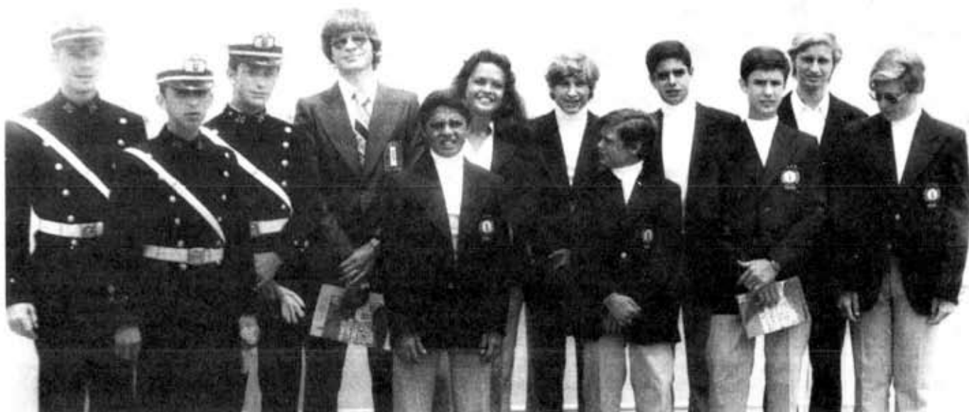
Peru District Representatives to the First World Youth Championship.