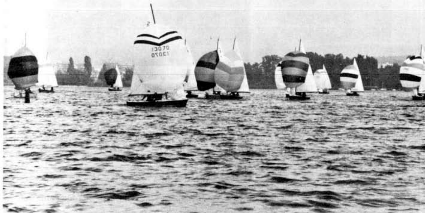
Faellanden: Swiss Championship

Plans for the coming year include trying to maintain the quality and quantity of competitors during the World Championship year and investigating the possibility of a new fleet in the Houston area.