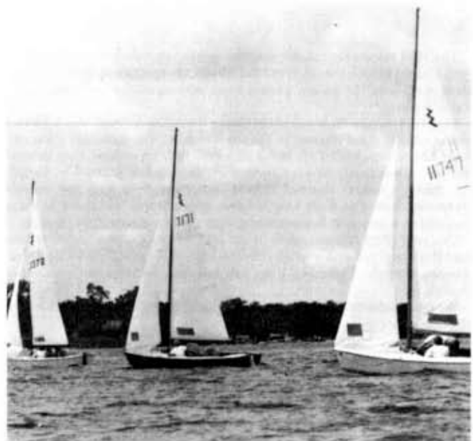
Close Fleet 180 competition on Conneaut Lake.