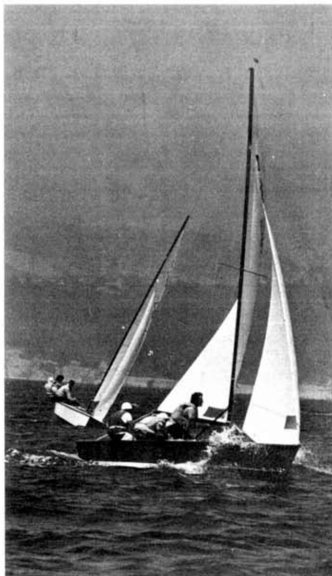
Close competition at the windward mark in 18-20 knot wind.