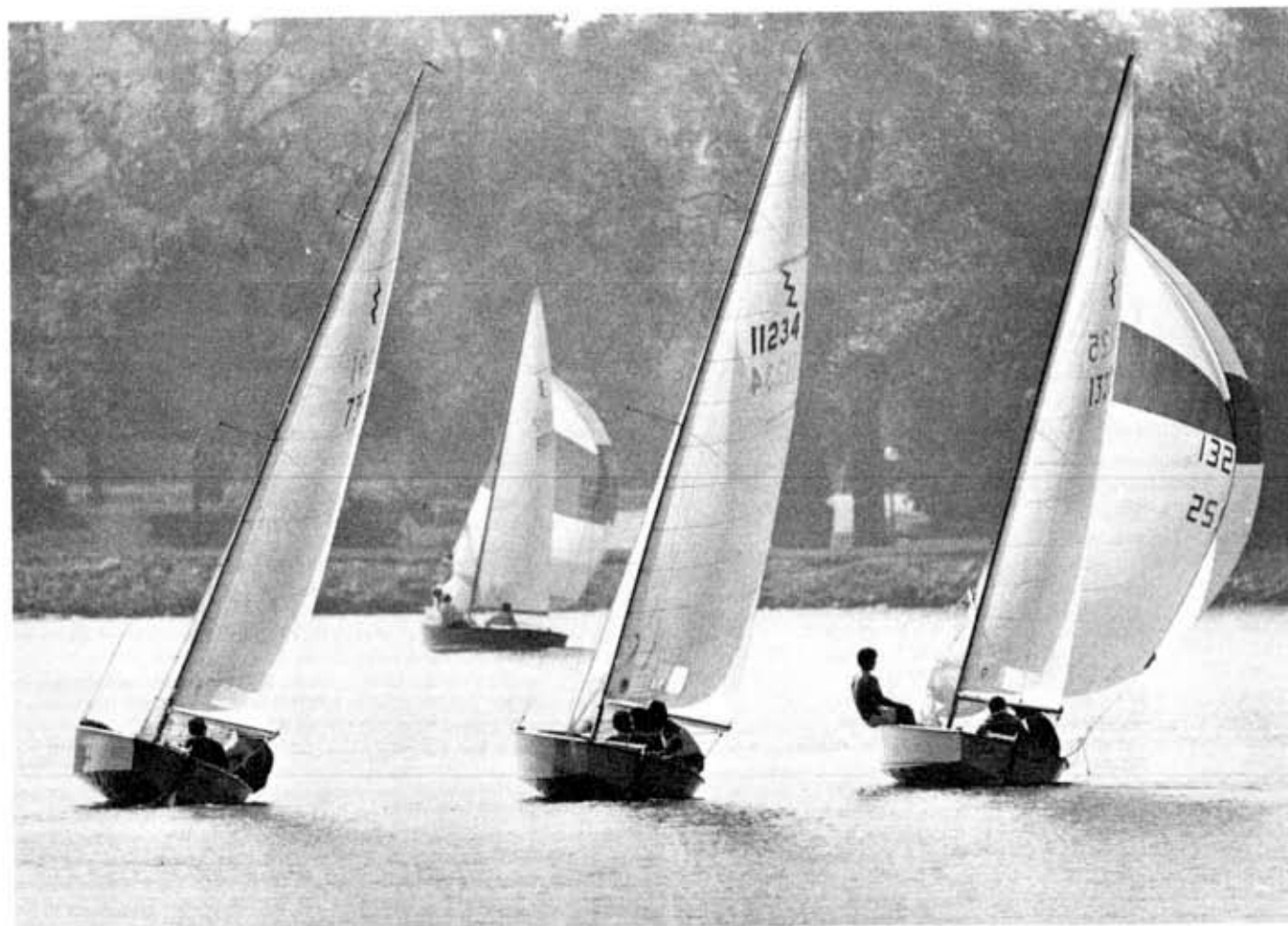
Crowded lake sailing in light winds but with no waves and no current.