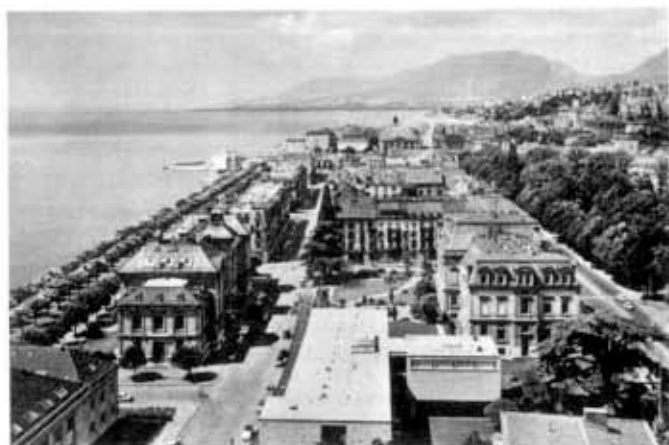
A beautiful view of the city and the lake.