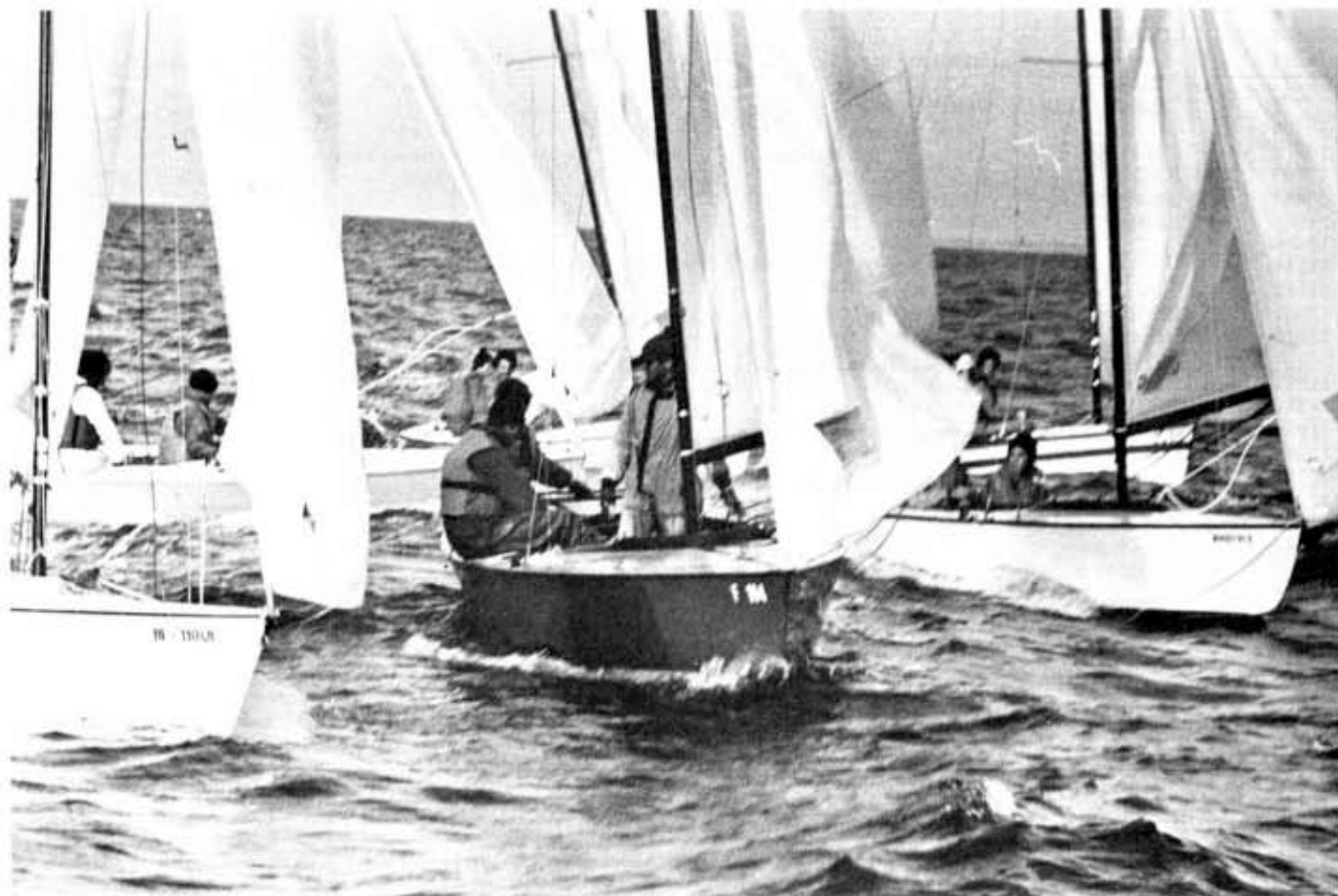
Jockeying for position at the start of the Winter European Championship.