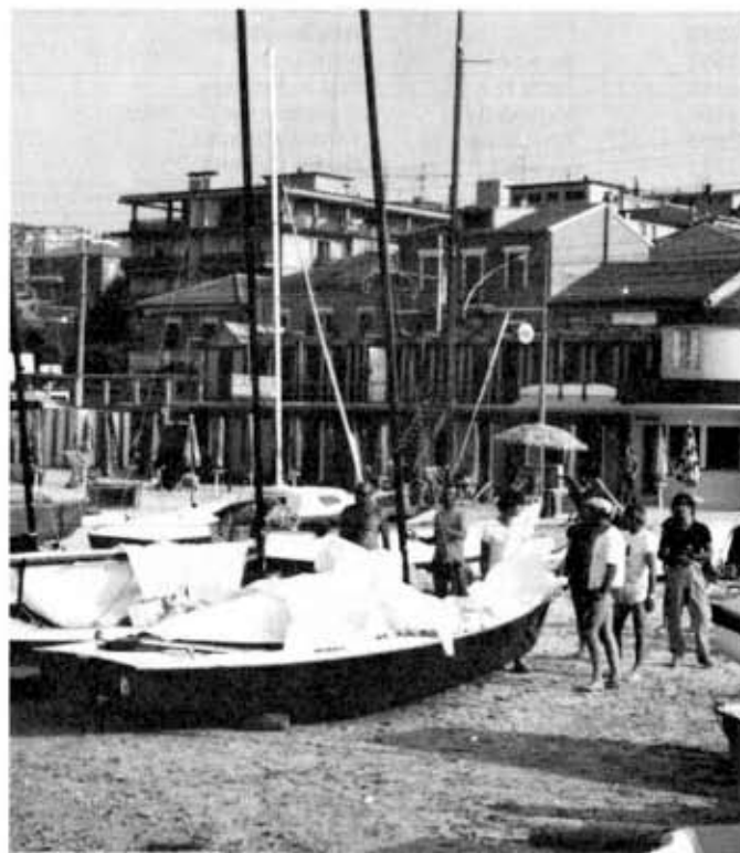
The beaches of Falconara near Ancona.