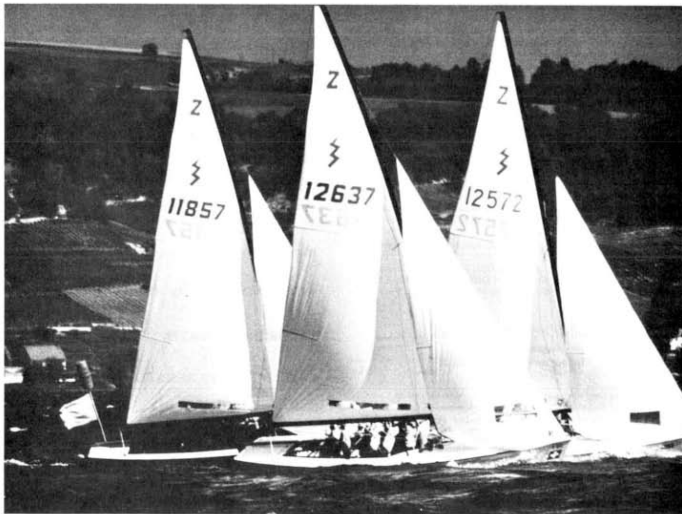
Tight competition at the windward mark at the "Pfaucup."