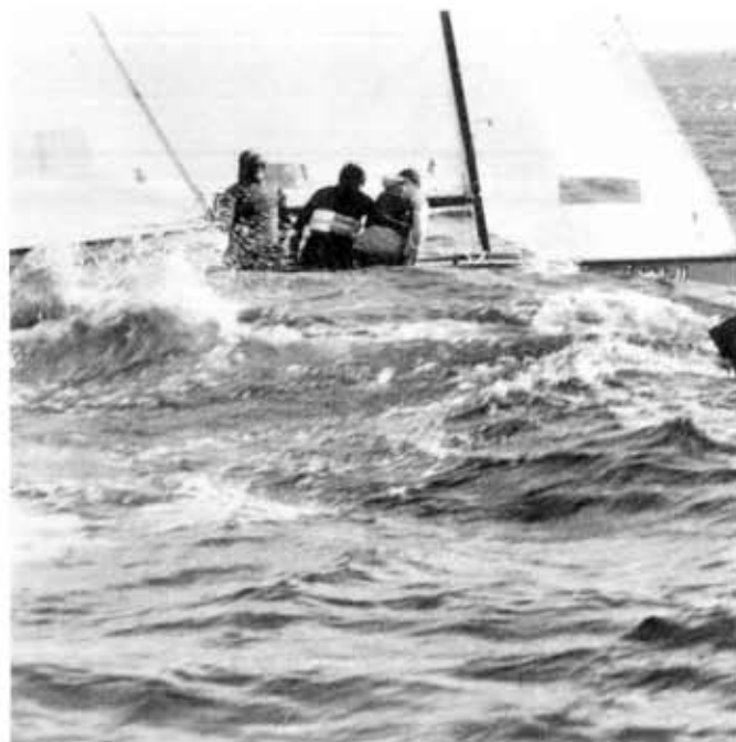
The gun has sounded and oh what swells!!