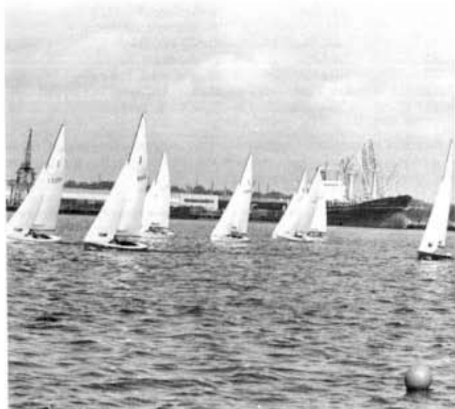
Start of Race 2, Riverton YC Fall Regatta

This year, we want to thank Red Bank, Cedar Point, Niantic, Nyack, Ocean City, Metedeconk, Brant Beach, Susquehanna, Annapolis and all Lightning sailors everywhere.