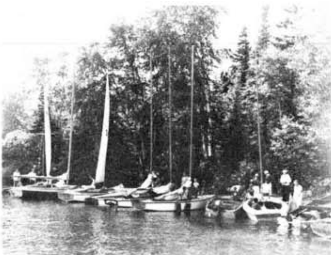
From little Lightning sailors, big Lightning sailors grow—History: Temple Reef Lightning Fleet picnic on Lambert Island during the "50's."

The 1981 Canadian Summer Games will be held in Thunder Bay, with Lightnings and Lasers being the boats used for the sailing. The whole fleet is quite excited about this event and are looking forward to an excellent season in general.