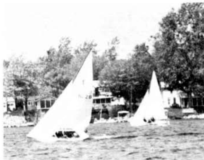
6228 driving hard on the wind!!

While spring is a long way off, plans have already begun for organizing something a little more regular for next summer, and as it looks now, it will be tougher for Sundance to repeat this season's performance.