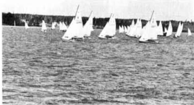
"On the Rocks"—The Opening Regatta of the season Finland District held on Tuusulanjarvi Lake just after the ice-break.

During the next winter we will meet on the first Tuesday of the month at 7 p.m. to learn the mysteries of sailing. All sailors are welcome to join us at Krapinhovi mansion.