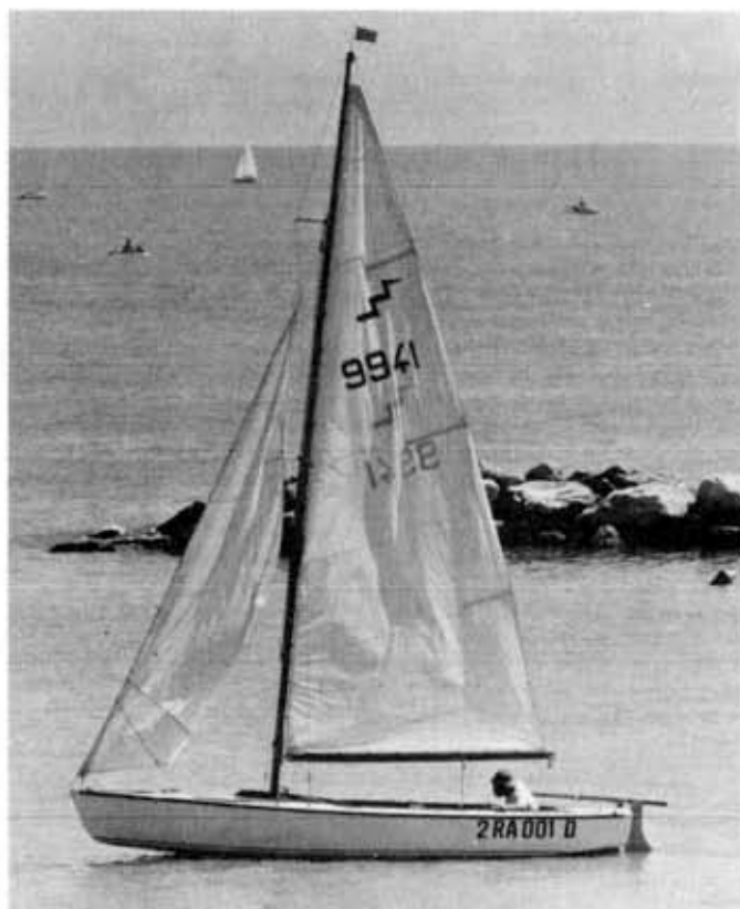
The oldest Lightning of the young Fleet

Boat 13401, Tika took part in the Italian Championships at Anzio on Tirrenian Sea.