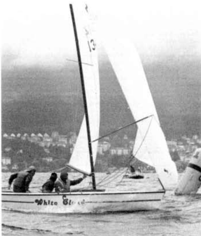
European Championship SUMMER TIME!!! White Cloud: is sunshine your adversary?