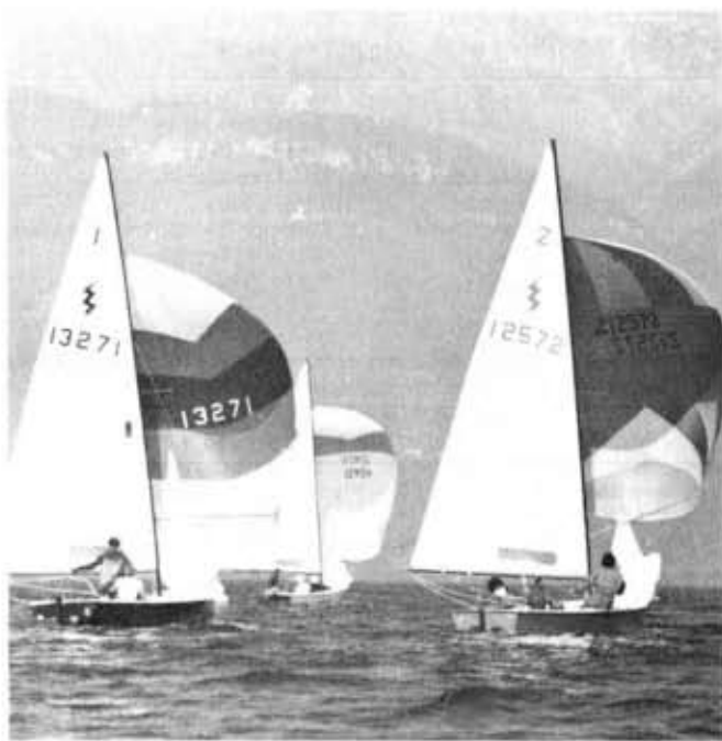
The Runner-Up Sauro Scarpocchi in 13271.