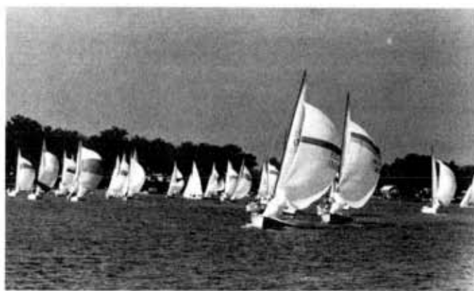
Keen racing on Devil's Lake.