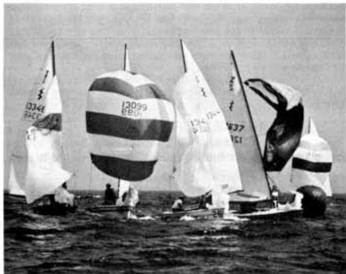
Jib Mark: Hard work for the jib men.