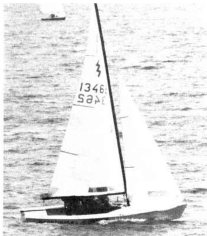
Areknames II wins the Moratti Trophy.

The Fleet 453 wishes a good wind to the Lightning sailors for 1982!