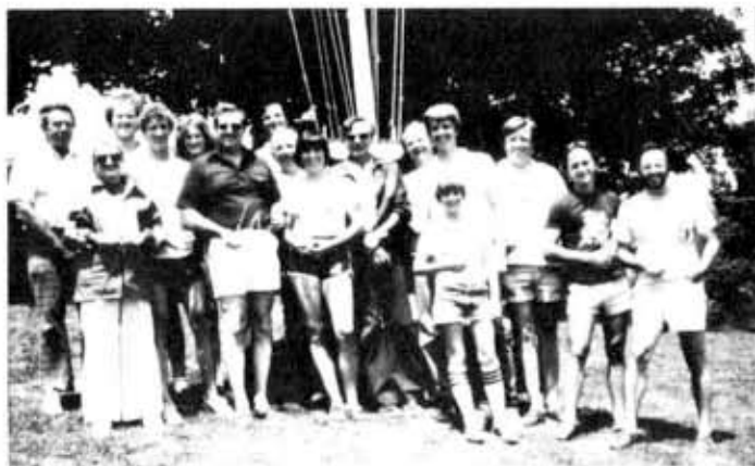
Indiana District's first five skippers and crews.

As you read this, you'll be packing up your boats for the Southern Circuit. We look forward to seeing everyone again in St. Petersburg and Miami, and remember, there's a steak at CGSC with your name on it!