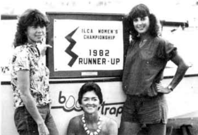
Florida women finish 2nd at Buffalo!