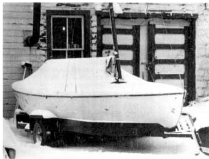
Preparing for a Mid-summer sail in Thunder Bay!

In the meantime, those with Lightnings and who are using them, are cruising along in the fast lane, and enjoying their boats very much.