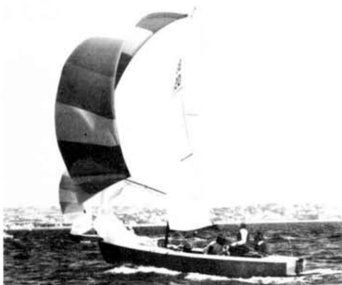
Italy: the sun is shining and the regatta is delightful.