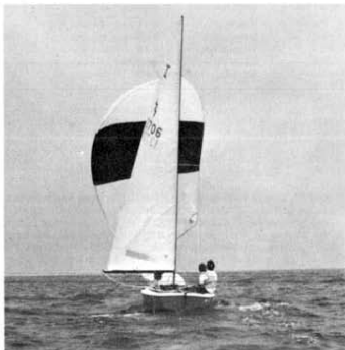
Messina, Vitaggio, Nizza — Ischia — Worlds '83

The fleet looks forward to 1984 and wishes all Lightning sailors good sailing.