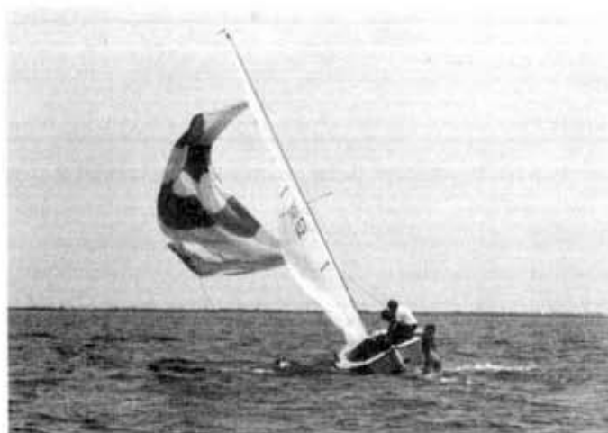
What do you do when you skipper decides to take a swim?