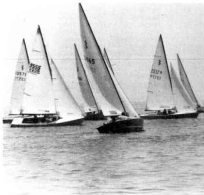
Boats in Fleet 393 "Jockey for position" at starting line.