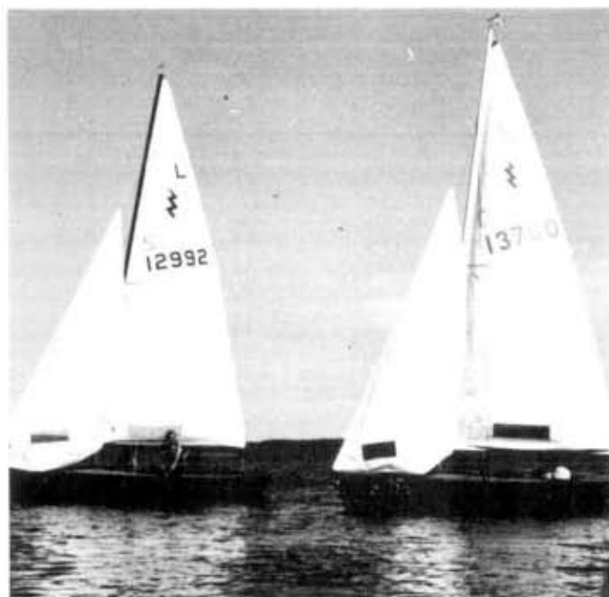
Janita (12992) and Sea Horse III (13760) on Lake Mallasveki.