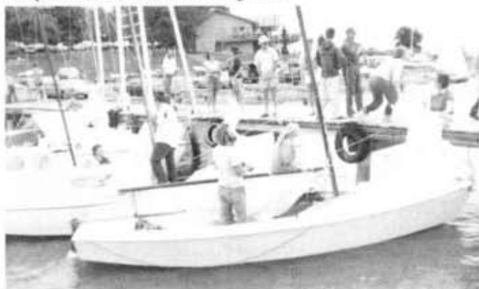
Readying for second race Jackson, Mississippi (Hospitality Regatta) G.R.I.T.S.

So much to do — no time to do it. This seems to be the theme of the District. We each have hundreds of Fleet Races, Series, and Holiday Regattas. Competition is fair at home so there's no reason to go out of town or is there? Better competition, challenging conditions, and a change of scenery. Also don't forget the camaraderie of this District. So try to travel next year and make a fellow sailor go also.