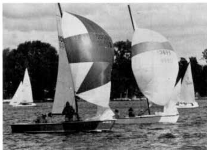
Devils Lake Regatta

A GREAT SEASON! See You all at the N.A.'s at Tawas.