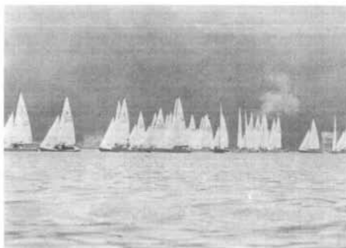
Champagne Start 1984 Champagne Regatta.