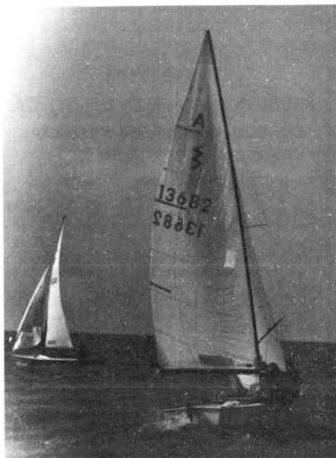
Angel Vila, Fleet 206, Spring Regatta Champion.