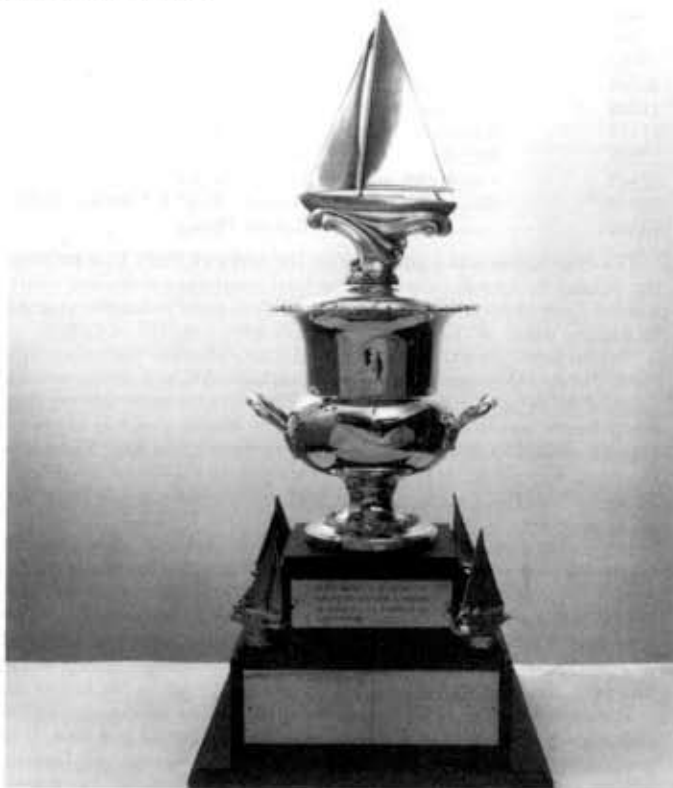
Pontiac Yacht Club Fleet 54 was proud to receive the Steketee trophy (pictured above) for the greatest increase in Fleet membership in 1985.