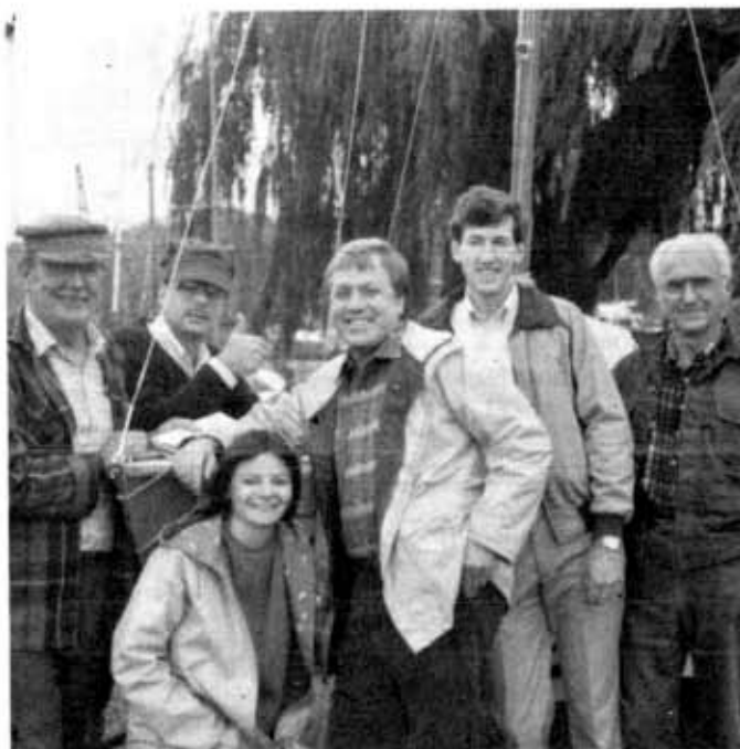
Fleet 39, Winning Team.