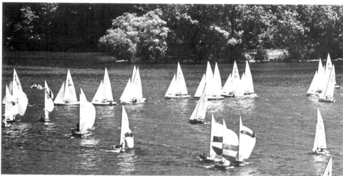
"Celebration of Spring" fifth race off Stony Point.