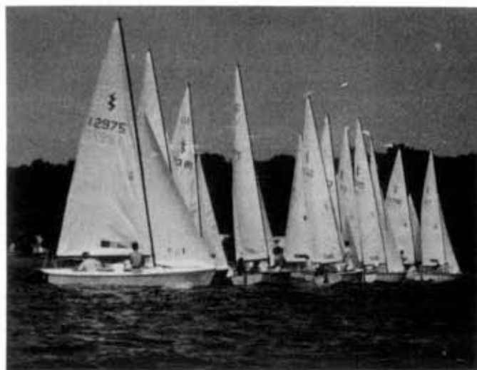
The Regatta Fleet gets off to a good start on Lake Wallenpaupack.

Fleet 16 signs off with the eternal cry of the racing sailor: "WAIT 'TIL NEXT YEAR!"