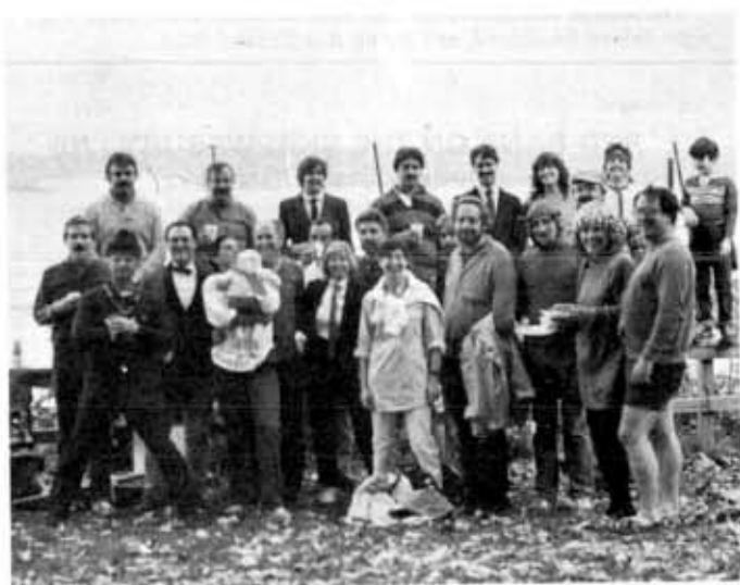
Fleet 75 members "Dress to Impress" for their Halloween season finale.