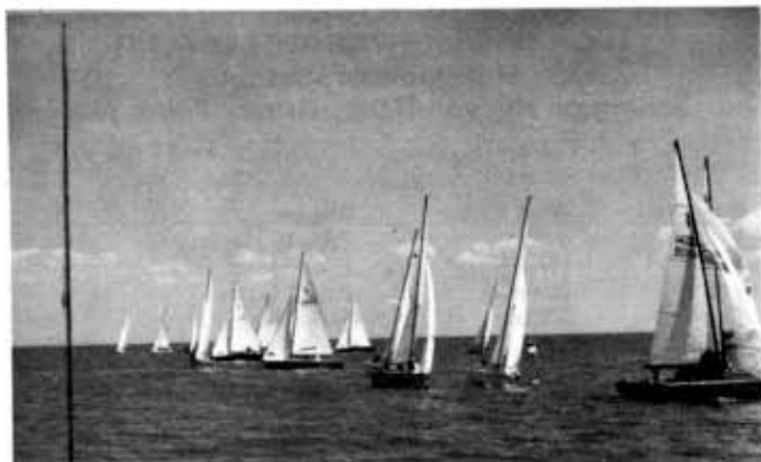
Windward Mark action at the 1985 Michigan Districts.