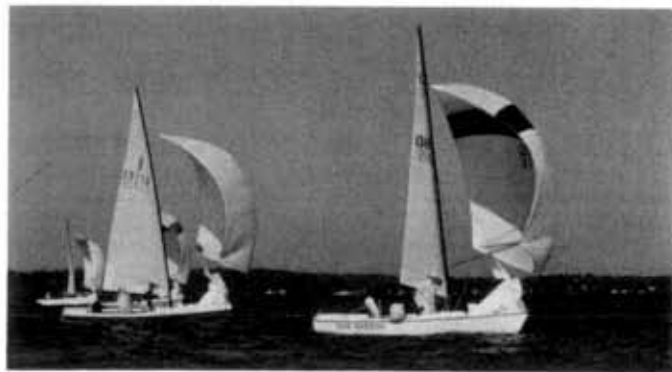
Downwind action at Fleet 137.

We are looking forward to another active year in 1986 with even greater participation in both races and regattas.