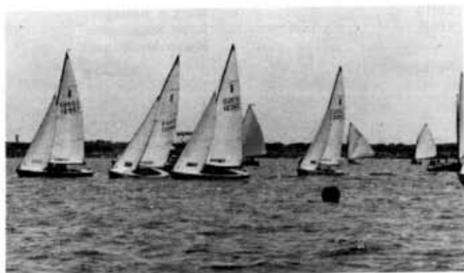
Lavallette Yacht Club — One of the starts in 1985 on Barnegat Bay — Calm water on this occasion.