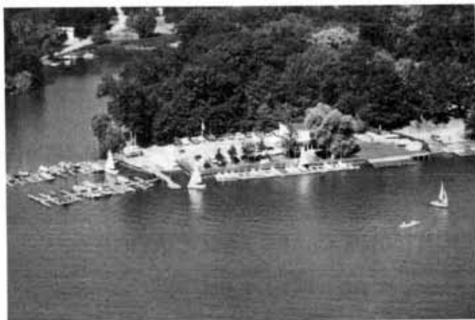
Aerial view of Newport Yacht Club.