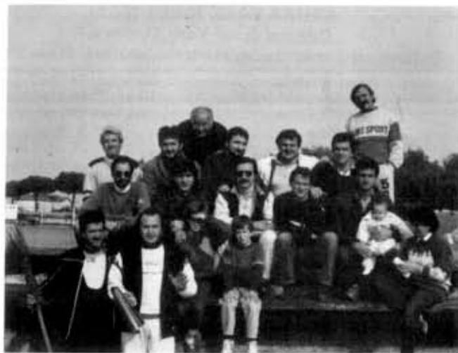
The young and old of Fleet 249.

In recent years the fleet has seen a decline of activity, due mainly to a leveling off of small boat activity at EYC. This year, however, we have several new owners of boats in the area and some have already joined the fleet. We will be having a meeting soon to select officers for the activities in 1986.