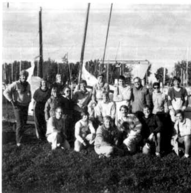
Wednesday nite sailing group at Bay City Yacht Club, Fleet 216.