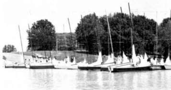
The Memphis Fleet prepares to do battle.