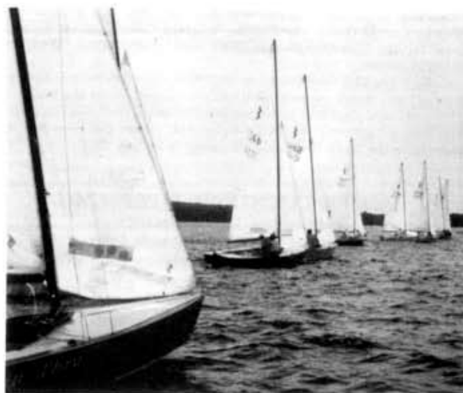
The fleet lines up on Massabesic Lake, Manchester, N.H.